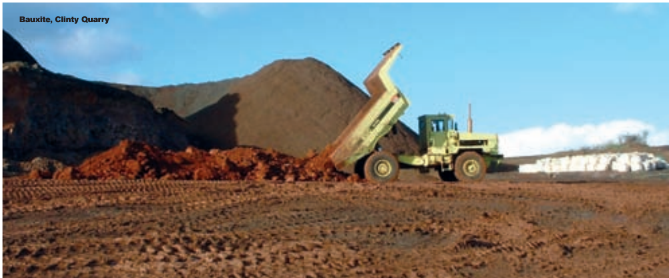
Bauxite, Clinty Quarry