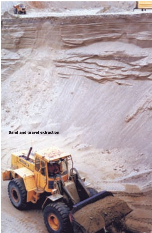
Sand and gravel extraction

The Mineral Resources Map of Northern Ireland comprises six sheets, one for each county (including county boroughs) at a scale of 1:100,000. The mineral resource data depicted on these maps are also available in a digital format for use within a Geographical Information System (GIS).