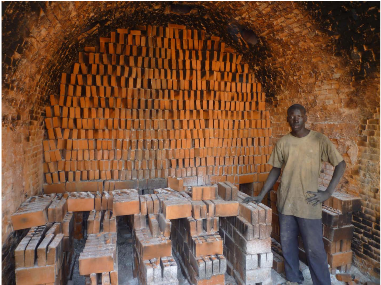
Figure 2. Tunnel kiln, Marisa Brick Company, The Gambia

Marisa Bricks is a well established company that produces approximately 15,000 bricks per month. The brick clay is mixed with kaolin (from Bafuloto) and extruded as bricks which are air dried and then fired in wood fuelled tunnel kilns (Figure 2). In addition, at this site, there is a lateritic-gravel processing plant producing washed construction aggregate, several plastic product production lines and a sweet factory.