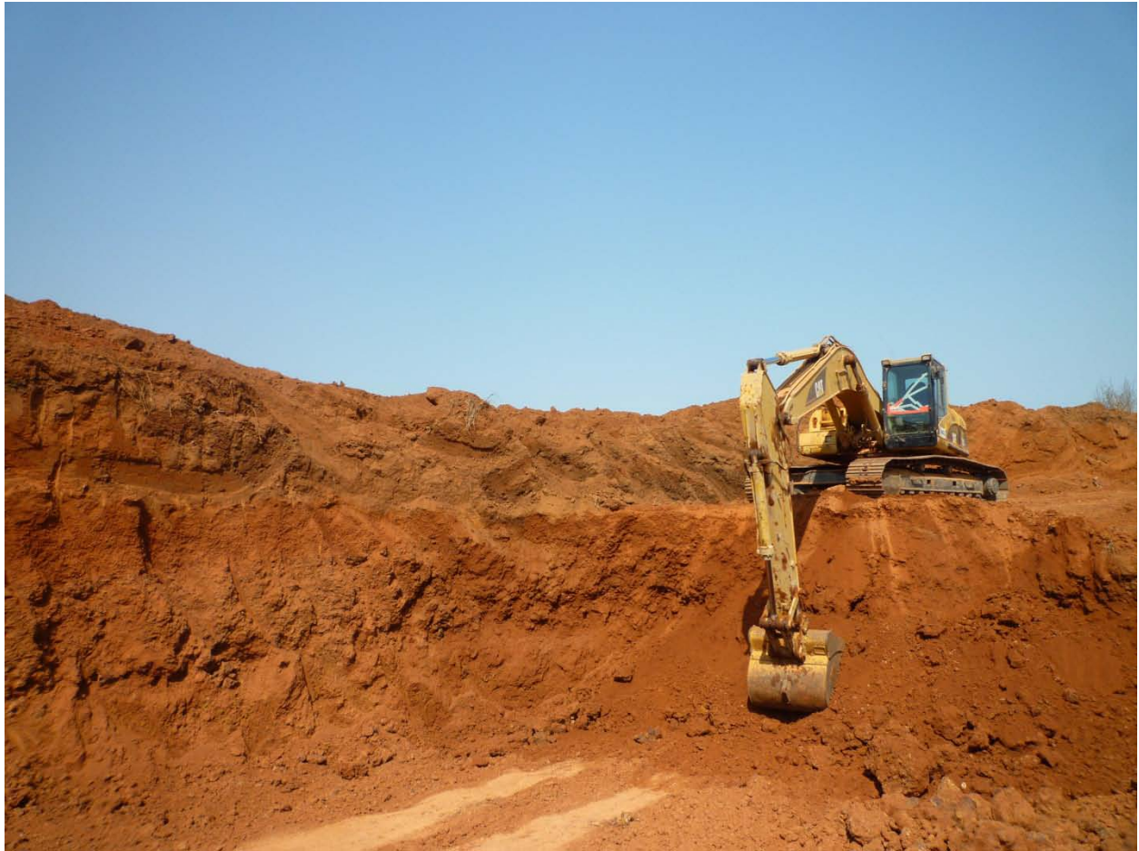
Figure 3. Lateritic-gravel quarry, Faraba Bant, The Gambia

In addition to the field visits, companies and organisations that have a stake in the establishment of a GeoLab at the Geological Department were consulted as follows: