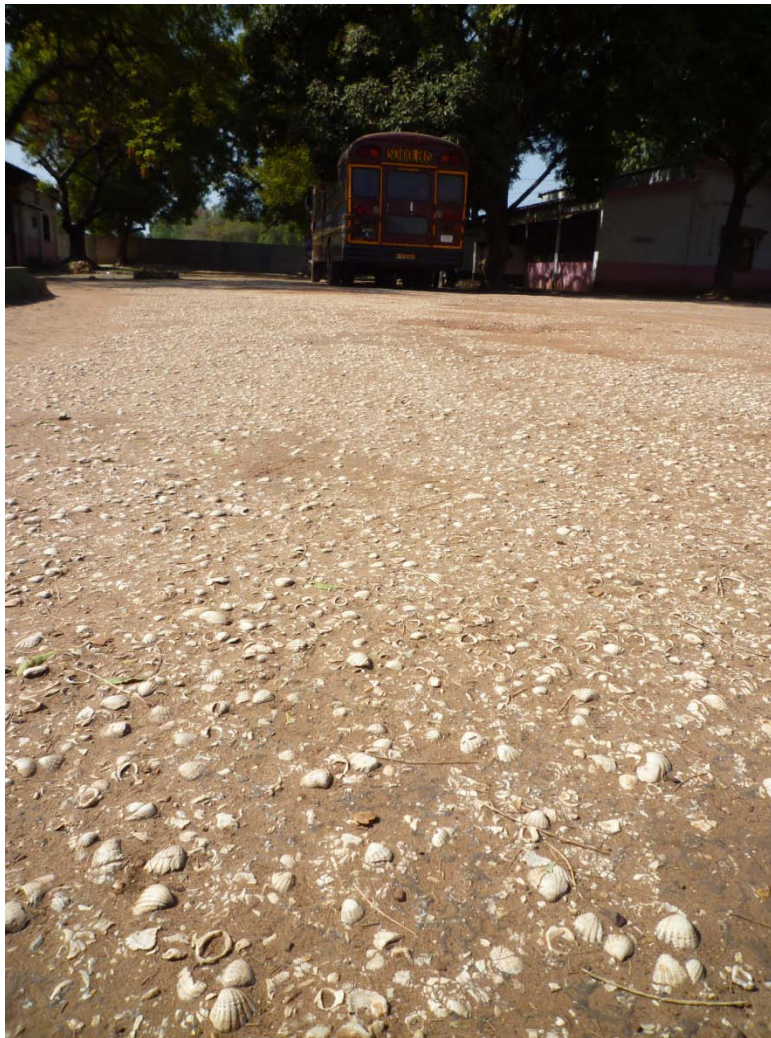
Figure 4. Cockle-shell road at the Gambian Technical Training Institute, The Gambia

An interesting feature was the old road surfacing material still evident on the GTTI campus. This shows the use of cockle shells in the wearing-course layer of the road (Figure 4).