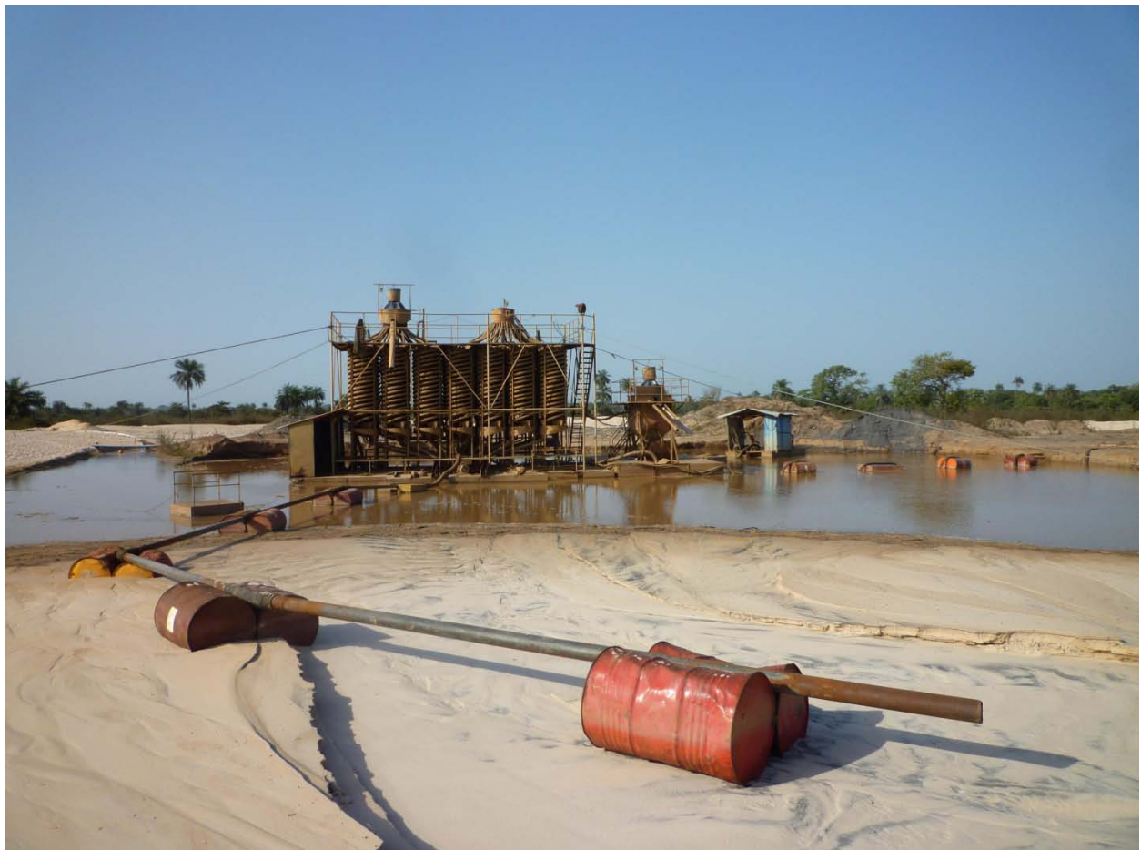
Figure 1. Heavy mineral beach sand processing plant, Sanyang North, The Gambia

This is the site of a heavy mineral sand processing plant (Figure 1). This consists of a pontoon with 14 double spiral gravity separators that produce a heavy mineral concentrate (mainly ilmenite plus rutile and zircon) and quartz sand tailings (waste product). The heavy mineral concentrate is stored in nearby stockpiles that are guarded by the Gambian police.