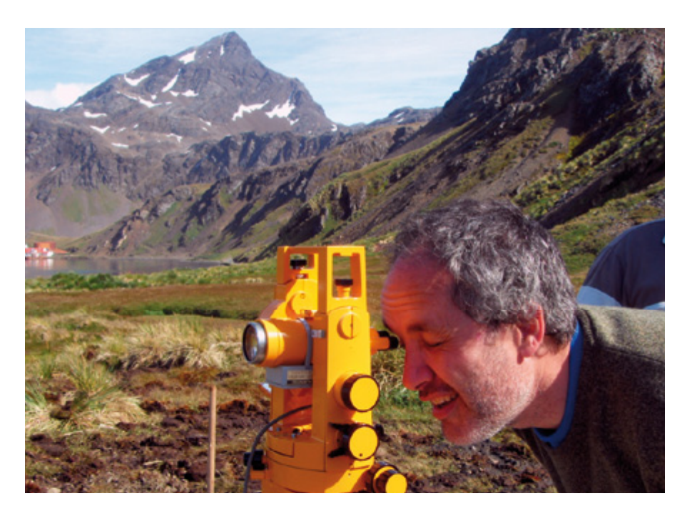
Manual survey during installation of the new BGS magnetic observatory on South Georgia. This observatory will be used to monitor the weakening magnetic field in the 'South Atlantic anomaly', where space weather impacts deeper into the atmosphere.

Scientific insights since 2003 are already producing improved hazard models, including a new BGS–Lancaster University model of GIC flow in the UK grid. This is cutting-edge science where we have combined a three-dimensional model of the Earth's electrical conductivity underlying the UK with a two-dimensional, time-varying model of electrical sources in the ionosphere. We