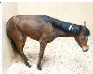
A pony exhibiting the classical clinical signs of equine grass sickness with severe weight loss, a 'tucked-up' abdominal appearance, 'elephant-on-a-tub' stance and depression