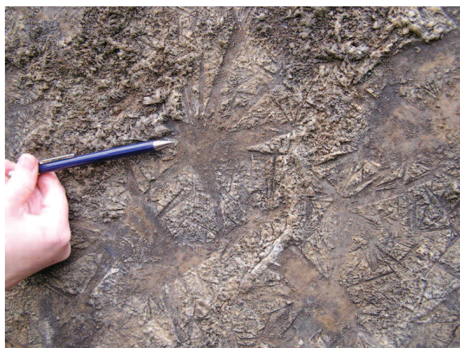
Figure 5. Structures interpreted to be formed by crystal growths of an unidentified mineral on a fracture plane, Llandoverly, Mid Wales.

The way that the Wembury rosettes structures coalesce into one another is reminiscent of crystal growth developed along the bedding planes, as the structures exhibit fractal or fractal-like growth arrays, similar to many crystals and crack systems (Figure 5). Pseudomorphs and moulds after crystal shapes are well known in a number of different environments throughout the geological record from as early as the Proterozoic (El Tabakh et al. , 1999) and from as far afield as Mars (Peterson and Wang, 2006). A number of different minerals may grow in a rosette habit, often radiating a series of needles or acicular prisms outwards from a central 'seed', giving a radial or spoked, wheel-like structure. Looking at the crystal form of an aggregate is often not diagnostic of the original mineral, however, the typical minerals that may be present in a non-marine lacustrine or fluvial environment could include halite and gypsum and anhydrite.