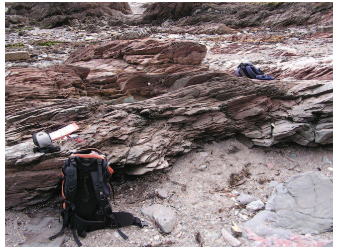
Figure 3. Typical appearance of the red and green-grey, cleaved siltstones, of the Dartmouth Group on the foreshore at Wembury Point.

(Smith and Humphreys, 1989; Jones, 1992), although lenticular channel-like beds have also been observed in the field, which may indicate a sporadic fluvial influence. Deposition of the sequence as a whole is considered to have taken place in a non-marine, perennial aqueous environment (Leveridge et al. , 2002), although Smith and Humphreys (1989) have noted some features indicative of subaerial sedimentation.