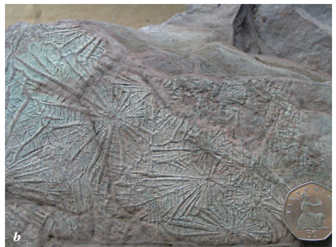
Figure 4. (a) Rosette structures seen along a bedding planes, highlighted by colour contrast in the sediments. (b) Slightly enlarged area of (a) showing the characteristic radial structure.