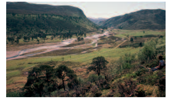
The River Feshie is a highly dynamic, gravel-bed river noted for rapid channel changes during floods. This braided reach is the most active of any gravel-bed river in Britain.

Much of the montane zone is incorporated within Site of Special Interest (SSSI) and National Nature Reserve (NNR) designations. At an international level, a large part of the area qualifies for designation under the European Habitats Directive and the European Birds Directive.