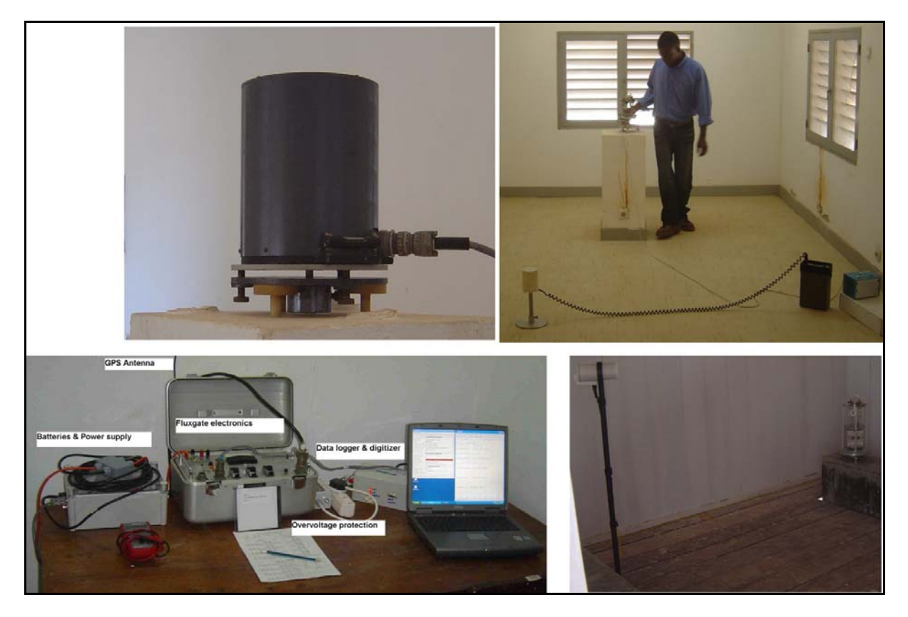
Figure 3. Typical INDIGO hardware. Clockwise from top left: The EDA triaxial fluxgate sensor in Nampula, Mozambique; Absolutes in Nampula with a Ruska DIflux and a Geometrics proton; DMI and GEM recording magnetometers in Kupang, Timor-W; EDA console and INDIGO logger in Maputo, Mozambique.

The original objective of the INDIGO project was to make use of fifteen EDA fluxgate variometers donated to the British Geological Survey (BGS), coupled with a low power digitiser to make filtered one-minute digital daily recordings.