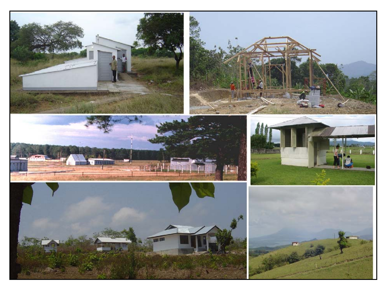
Figure 1 . Pictures of INDIGO installations. Top left: Variometer house at Maputo, Mozambique; top right: the newly erected variometer house in Pelabuhan Ratu, Indonesia. Middle left: Arti observatory in Russia; middle right: the absolute house at Tondano, Indonesia. Bottom left: the new Kupang observatory in Timor-West, Indonesia; bottom right: the observatory of Chiripa, Costa Rica.