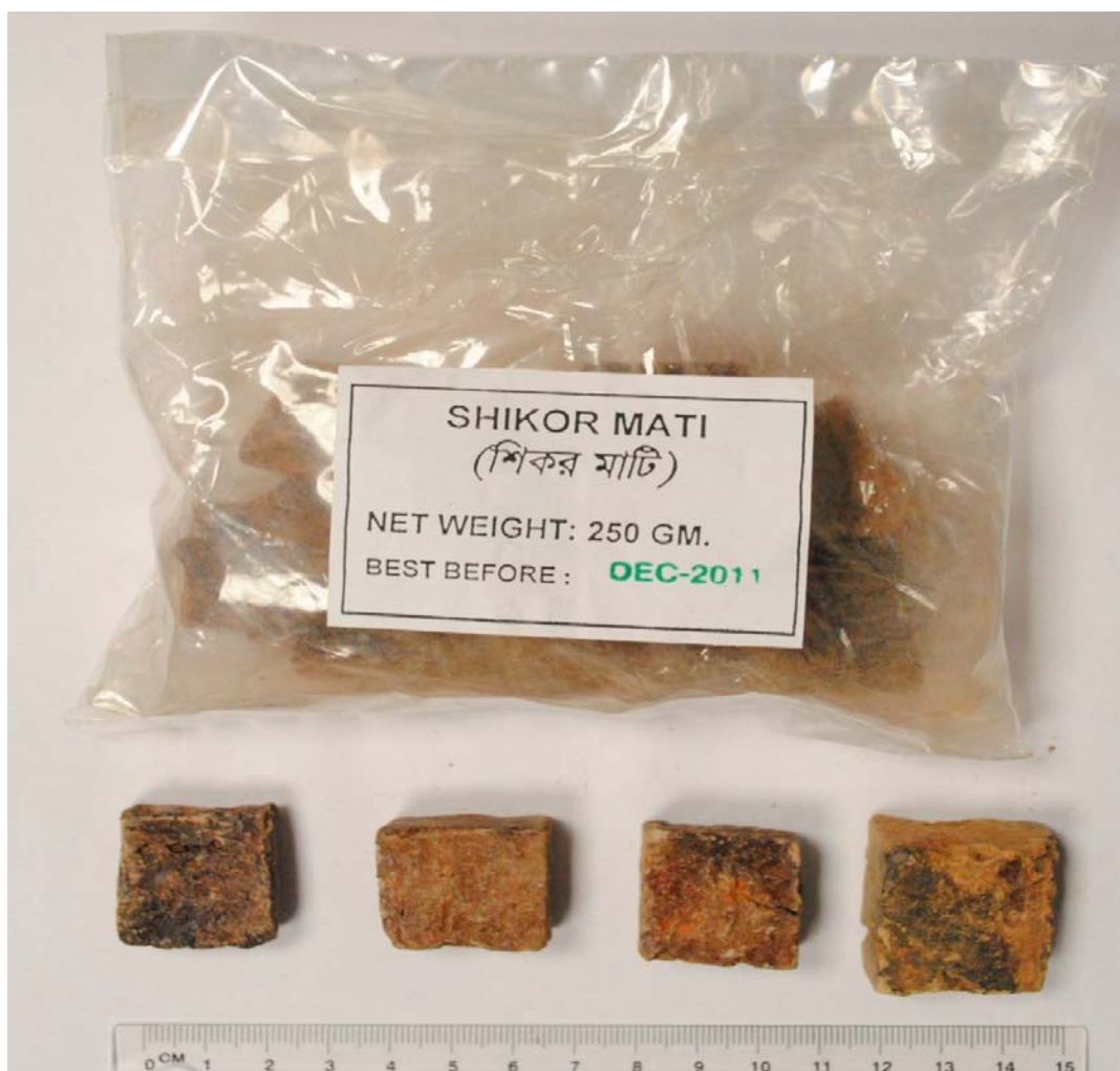
Figure 1 Typical example of Sikor tablets from Bangladesh purchased from shops in the United Kingdom. Shikor Mati can be translated as Sikor soil.

UK). This instrument was fitted with a micro flow concentric nebulizer and quartz Scott-type chamber. Helium ( 4 \text{ L min}^{-1} ) was used for collision cell gas and tellurium ( 50 \mu\text{g L}^{-1} ) was used as internal standard. Solutions were subjected to arsenic speciation analysis using a HPLC (GP50-2 pump, Dionex, USA) coupled to an ICP-MS (Agilent Technologies, UK). The HPLC conditions used were similar to that previously reported [20]. An anion exchange column (Hamilton PRP-X100, 250 \times 4 \text{ mm} , 10 \mu\text{m} ) was used to separate the As species. Ammonium nitrate was used as anion exchange mobile phase at pH 8.65.