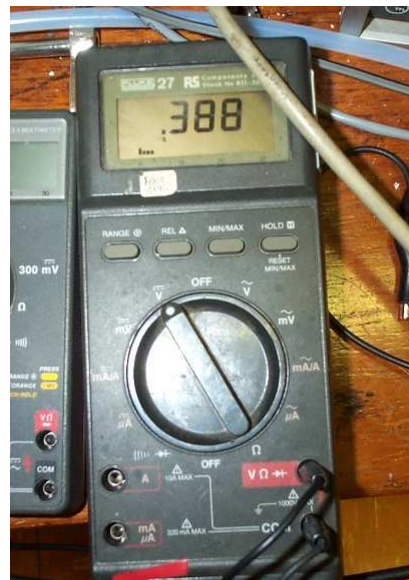
Figure 4: Fluke 27 voltmeter