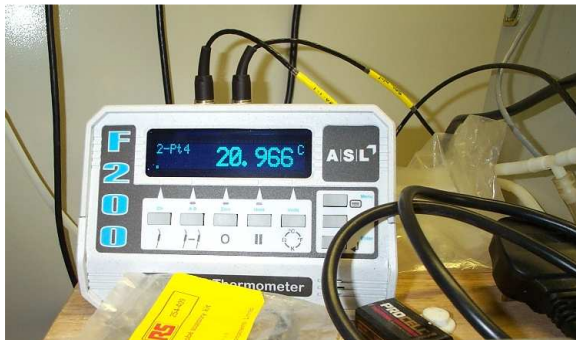
Figure 3: ASL F200 precision thermometer