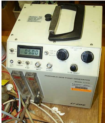
Figure 1: LI-COR LI610 dew point generator