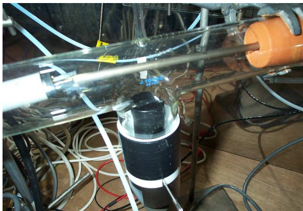
Figure 5: Sealed glass T-junction