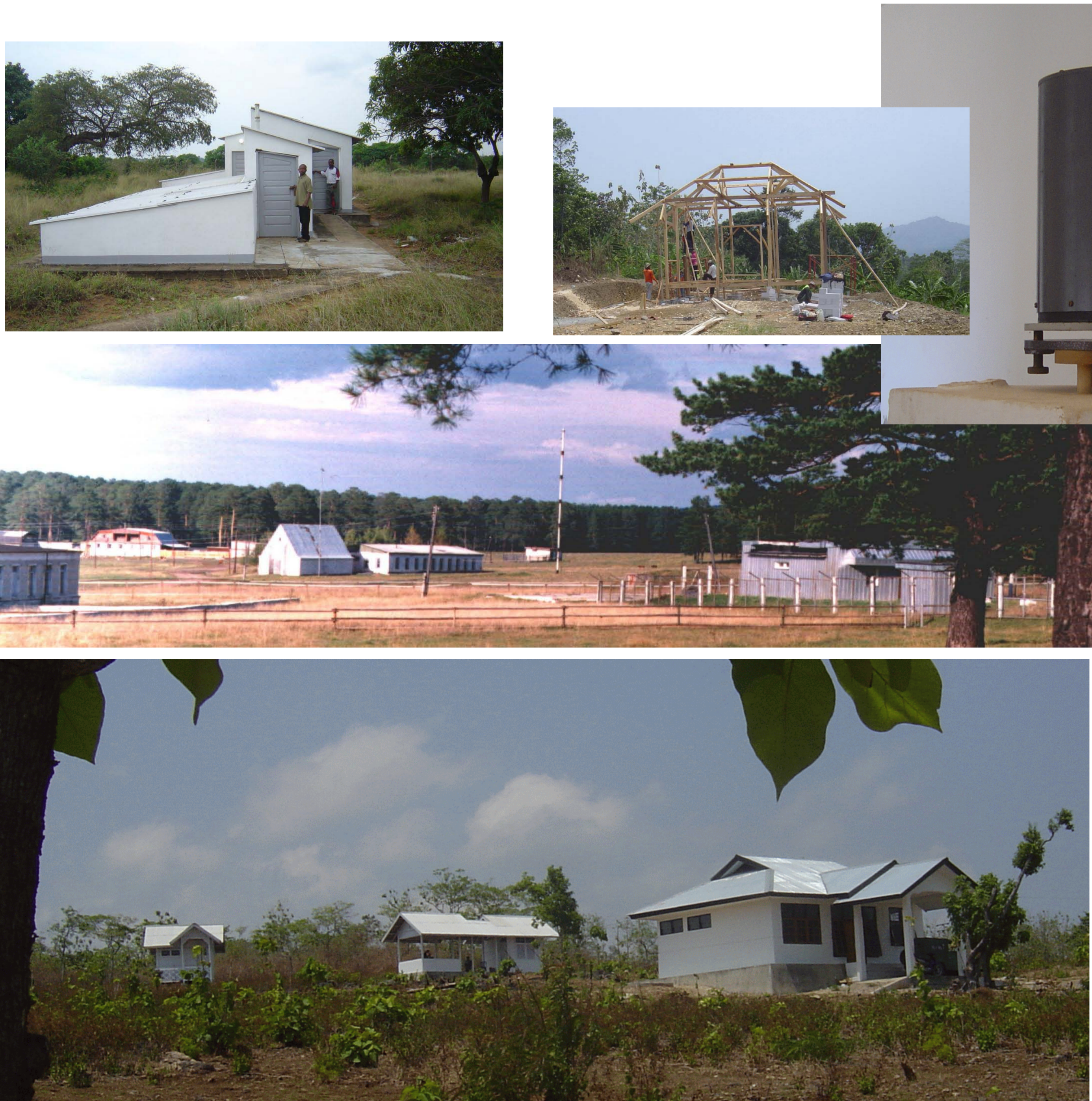
Figure 1: Pictures of INDIGO installations. Top: Variometer house at Maputo, Moçambique; the newly erected variometer house in Pelabuhan Ratu, Indonesia. Middle: Arti observatory in Russia. Bottom: the new Kupang observatory in Timor-West, Indonesia.

We find that the installation of successful observatory also depends on the motivation of the local observatory staff; with the help of the INDIGO project, most common problems can be overcome.