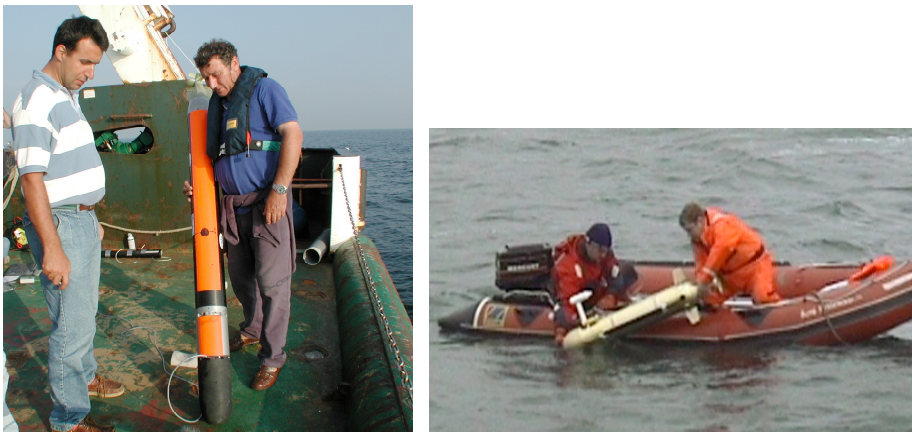
Figure 1 Small AUVs are easily deployed: left: the Mauve AUV ready for a North Sea deployment, right: the Gavia vehicle being deployed from a small boat.

Another small European AUV that is operational is the Gavia (Thorhallsson and Hardason, 2002). In addition to a CTD the Gavia can carry cameras, lights and sonar and has been used to investigate the effect on the benthos of new fishing gear and in studies of marine ecosystems. It is easily deployed from a small boat (Figure 1b).