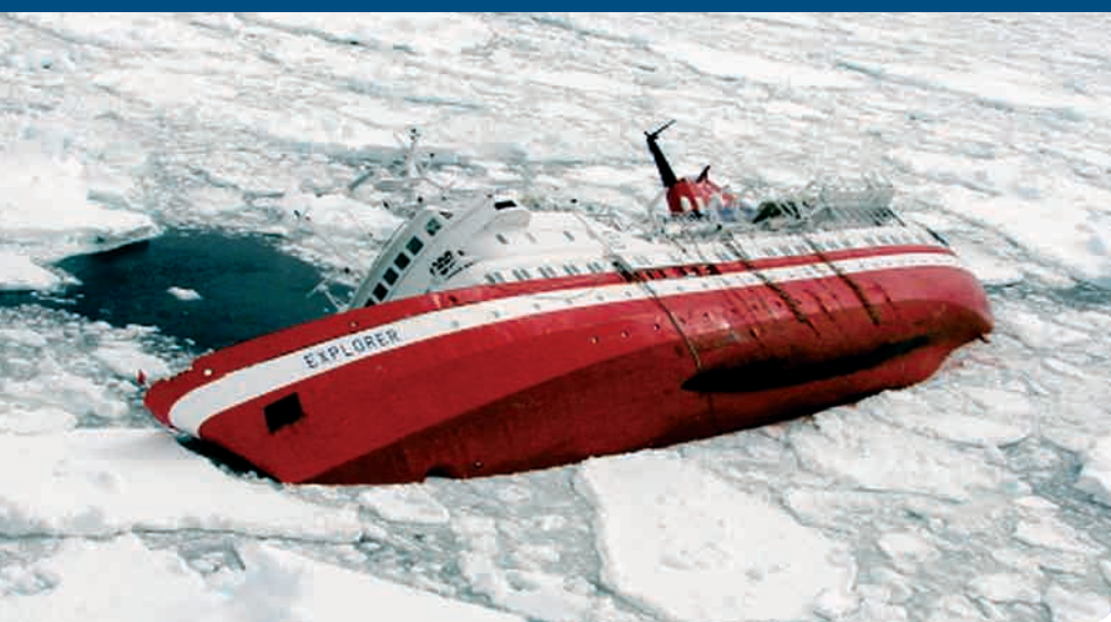
The MV Explorer tourist ship which sank in the Antarctic in November 2007.

The intention over the next two years is to develop other products such as detailed regional ice charts and potentially sea-ice forecasts. Eventually, we hope to have an operational international ice-charting service for the Southern Ocean which will aid shipping and help minimise its impact on the Antarctic environment. ❁