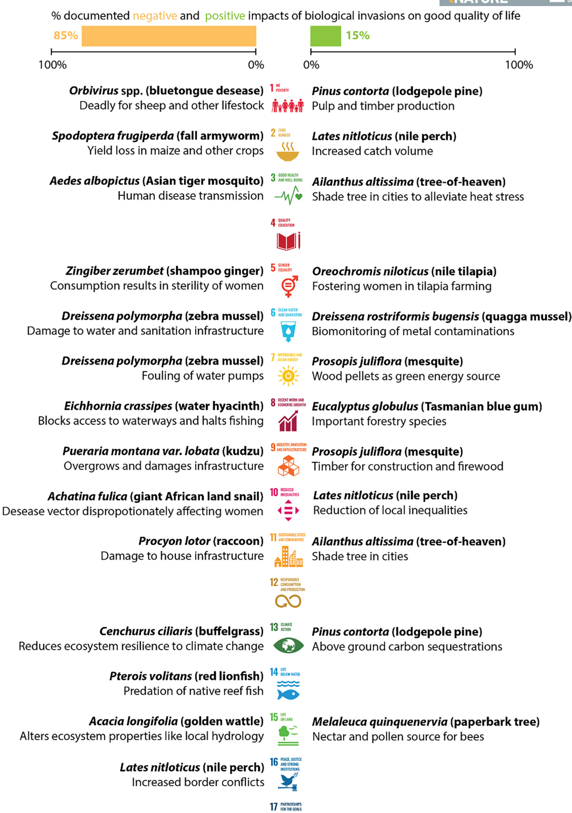
FIGURE 1 Examples of species with positive and negative impacts on the Sustainable Development Goals. Bars indicate the percentage of documented negative and positive impacts of biological invasions on good quality of life as reported in (IPBES, 2023), noting the overwhelming dominance of negative impacts. Positive impacts do not offset negative impacts and should be considered separately. Examples and associated negative and positive impacts for selected example species are based on the CABI Invasive Species Compendium (https://www.cabidigitallibrary.org/product/QI).

conditions) on Wiley Online Library for rules of use; OA articles are governed by the applicable Creative Commons