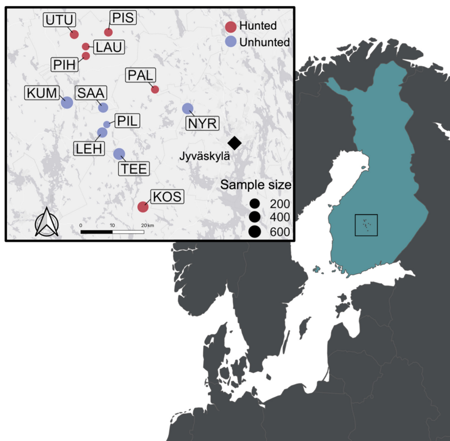
FIGURE 1 Map of parts of northern Europe with the inset showing the study site in Central Finland. The locations of hunted (red) and unhunted (purple) sites are shown with the abbreviations representing Koskenpää (KOS), Kummunsuo (KUM), Lauttasuo (LAU), Lehtosuo (LEH), Nyrölä/Valkeisuo (NYR), Palosuo (PAL), Pihtissuo (PIH), Pirttilampi (PIL), Pirttisuo (PIS), Saarisuo (SAA), Teerisuo (TEE), Utusuo (UTU), as well as the city of Jyväskylä. Point sizes scale in proportion to the total number of adults and chicks sampled per site.

Here, we generated and analysed a large microsatellite dataset comprising 3248 black grouse individuals from 12 sites in Central Finland. First, we performed confirmatory analyses of fine-scale population structure and used spatial autocorrelation analysis to test for signatures of sex-biased dispersal. Second, we investigated the effects of hunting on genetic diversity and inbreeding by comparing molecular diversity statistics between individuals from hunted versus unhunted sites. Third, we analysed the effect of hunting on dispersal by inferring migration rates and directions within the population in relation to hunting status. We hypothesised that population structure would be stronger in adult males than in adult females, as previous studies have documented fine-scale kin structure in males (Corrales & Höglund, 2012; Höglund et al., 1999; Lebigre et al., 2008) and greater dispersal in females (Caizergues & Ellison, 2002; Höglund et al., 1999; Warren & Baines, 2002). Although both sexes can be hunted, displaying males are likely to