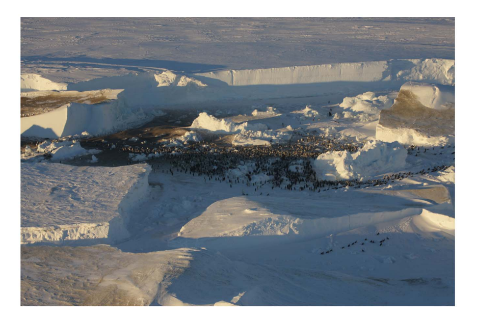
Figure 1. Eastern emperor penguin colony. Aerial view of the eastern emperor penguin colony (67°19′S, 145°52′E) showing adults and chicks present on November 1<sup>st</sup>, 2012. from an altitude of ca. 1,000 feet. doi:10.1371/journal.pone.0100404.g001

500 m during a helicopter flight involved in resupply operations. This western colony was located on a large and flat fast ice sheet extending from the Mertz glacier, ca. 20 km west of the first colony, at 67°14′S, 145°30′E (Figure 3). This colony was bordered on the north-west by a high ice cliff of the Mertz glacier. Numerous large tabular icebergs were grounded in the fast ice, south of the colony. This habitat was similar to that generally found in the Ross Sea area, characterized by stable fast ice, nearby open water and access to fresh snow [25]. The site was poorly sheltered from the wind. The colony comprised one single group of ca. 3,980 downy chicks, and 2,300 adults. From empirical observation, these chicks seemed bigger, and better fed, than those of the eastern colony. Three Antarctic skuas Catharacta maccormicki and one giant petrel Macronectes giganteus were sighted flying over the colony. Only 17 dead chicks and one abandoned egg were found during our 3-hour survey, some of them partly buried. The ice surface was of heavily compacted and abraded snow, and it is therefore most likely that more dead chicks were buried beneath the snow surface. Guano traces were restricted to the area currently occupied by the birds, and its direct surroundings. Due to these difficult conditions, we were unable to precisely locate the incubation area. As for the first colony, we did not observe any individuals bearing flipper-bands.