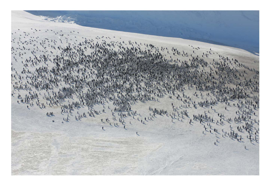
Figure 3. Western emperor penguin colony. Aerial view of the western emperor penguin colony (67°14′S, 145°30′E) showing adults and chicks present on November 2<sup>nd</sup>, 2012. from an altitude of ca. 1,000 feet. doi:10.1371/journal.pone.0100404.g003

due to variability in density and to inter-annual variability. This suggests that this colony was not the only one to be missed by the 2009 and 2012 satellite surveys, and that more colonies remain to be discovered in other parts of the continent. Although not always possible each season due to cloud cover and the availability of the satellite, our results suggest that satellite surveys should be conducted repeatedly and combined with field surveys to ensure that colonies are not missed. Our paper shows that to allow confidence in satellite observations, a multi-temporal/multi-year approach has to be used to ensure that breeding sites are not missed due to heavy snowfall, deep shadows or topographic features such as ice cliffs. If possible, these observations should be backed up with aerial or ground counts as the limited special resolution of satellite imagery results in large inherent variances when calculating breeding populations. Innovative cameras combined with biologging would also be very useful to complete the satellite survey. For instance, since the satellite survey based on 2009 imagery, four more emperor penguin colonies have been discovered: two on the West Ice Shelf detected by aerial survey [27], and two others on the West Ice Shelf and near the Jason Peninsula identified by satellite survey [28].