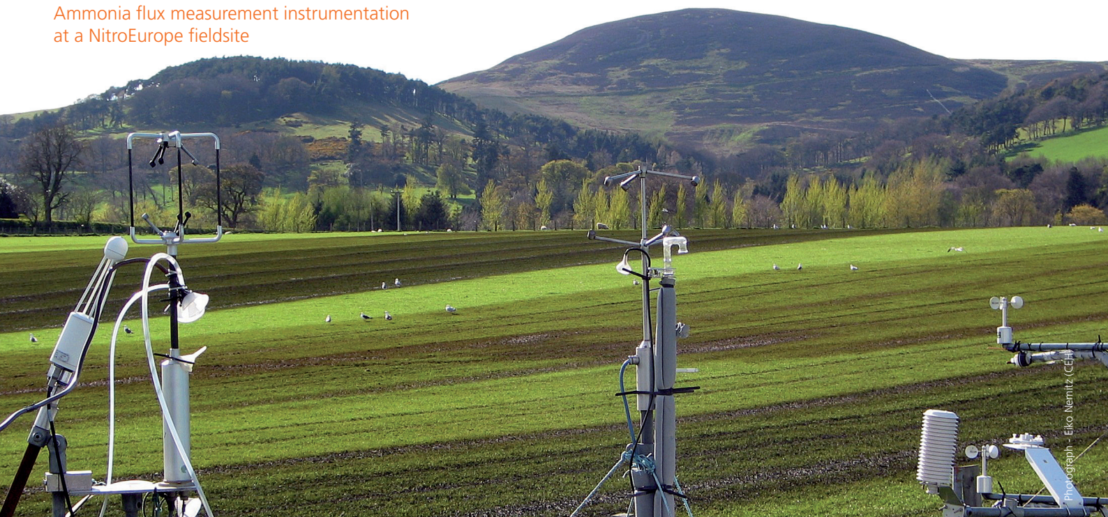
Ammonia flux measurement instrumentation at a NitroEurope fieldsite