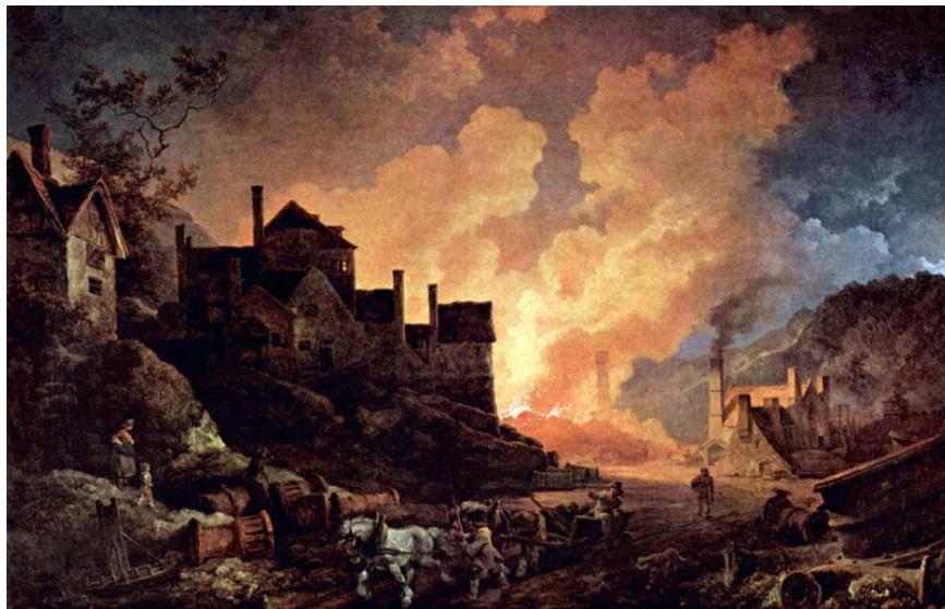
Coalbrookdale by Night 1801. Oil on canvas, 680 x 1067 mm. © Science Museum, London [Wiley have permission to use this – see Cover]

Photograph 1: Oil painting by Philippe Jacques de Loutherbourg (1740-1812) showing one of the Coalbrookdale ironworks [England], the Bedlam Furnaces along the river Severn, at night silhouetted against the fiery glow of a furnace being tapped. The development of coke smelting in this area of Shropshire by Abraham Darby and his family in the 18th century revolutionised the production of iron and helped fuel the Industrial Revolution. Its unique combination of natural resources also led it to produce Britain's first iron rails, iron bridge, iron boat and steam locomotive.