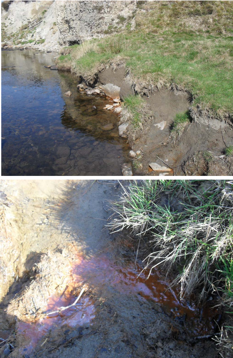
Figure 9 River bank seepages identifiable by orange brown staining.

During the site visit, which coincided with a prolonged period of dry weather conditions, surface runoff over the spoils was not evident, however signs of seepage at the base of the spoil heaps were observed (Figure 10). A pipe at NGR SN7425066046 (EA site 82970- Abbey Consols Spoil Runoff 2) is collecting a proportion of the drainage for monitoring the flow and quality of the spoil seepage (Figure 13). A boggy area was noted at the base of the spoil heaps (sample AC-7, SN 74262 66075, Figure 11) and upstream EA monitoring point 82970.