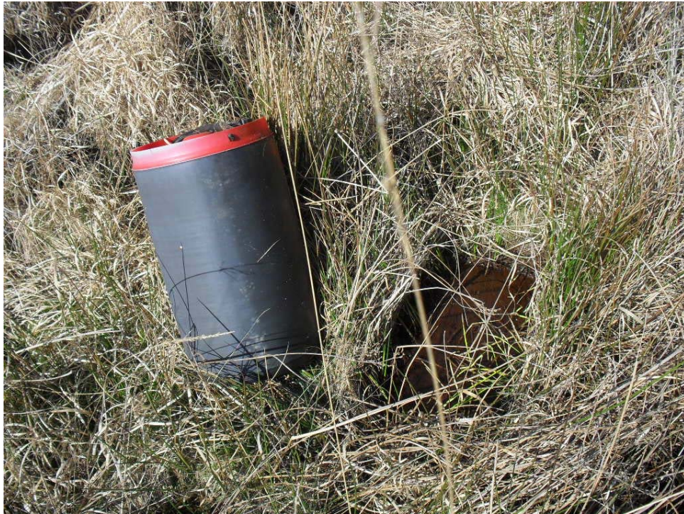
Figure 7 Detail of Figure 6 showing orange brown seepage in the ditch.