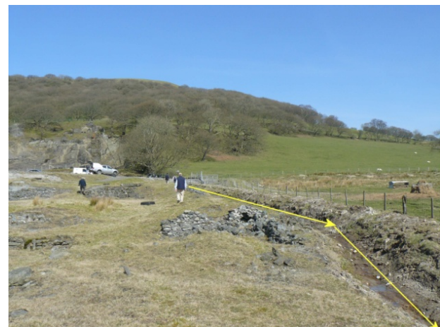
Figure 15 Ditch to east of spoil heaps (arrowed).