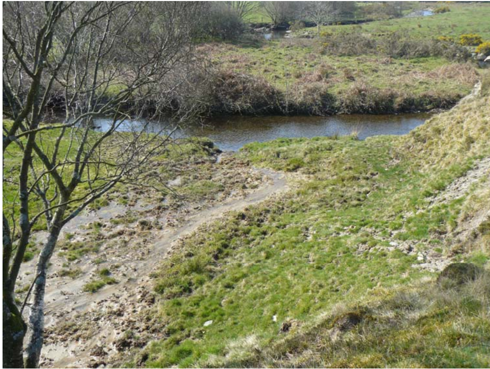
Figure 18 Drainage from Abbey Consols mine entering Afon Teifi.