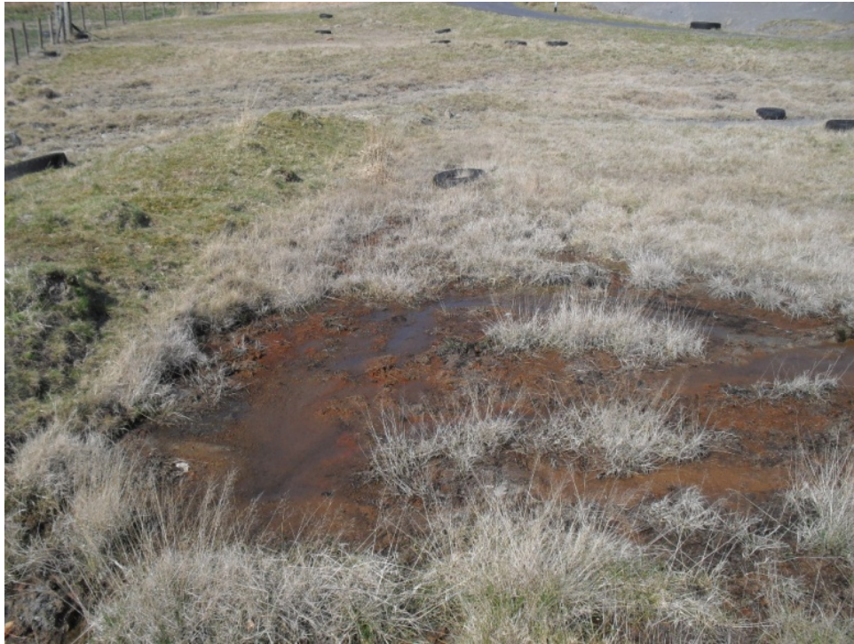
Figure 12 Detail of the marshy area in Figure 11.