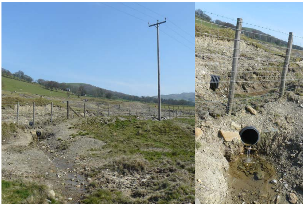
Figure 17 View of mine spoil area with pipe collecting water from ditch running to the east of spoil heaps (EA monitoring site 82989). Behind the fence it is visible an additional pipe collecting ponded water (EA monitoring site 82969).