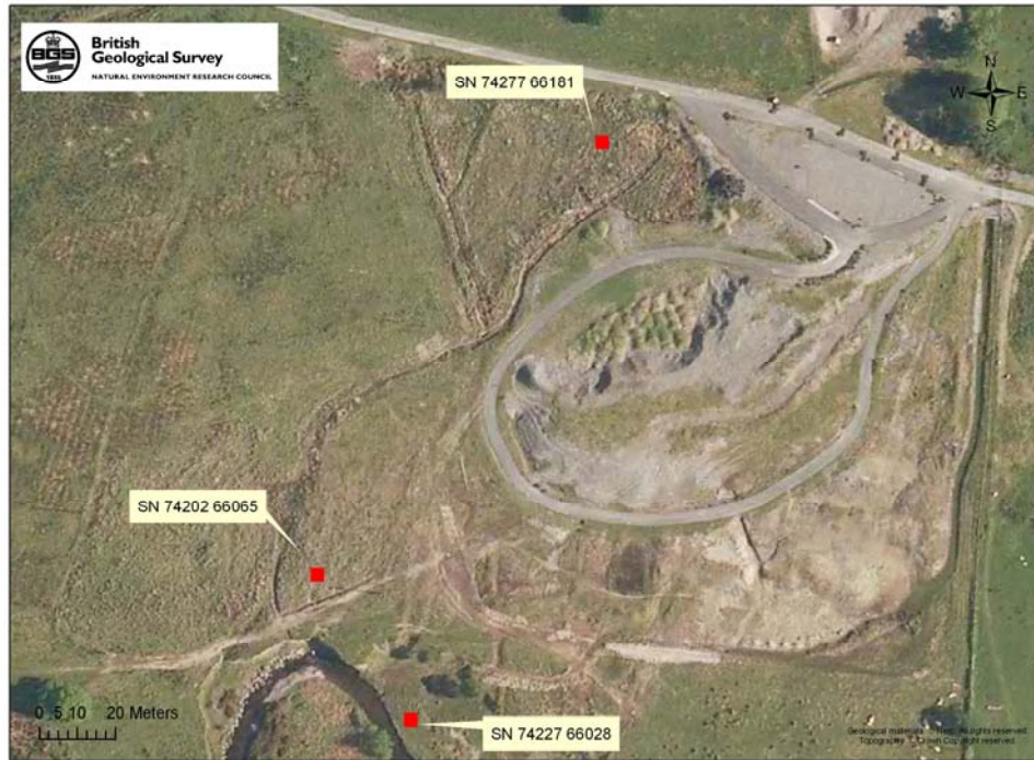
Figure 5 Location of alluvium exposure as noted in the text. (Aerial photography © Getmapping Licence No. UKP2006/01).