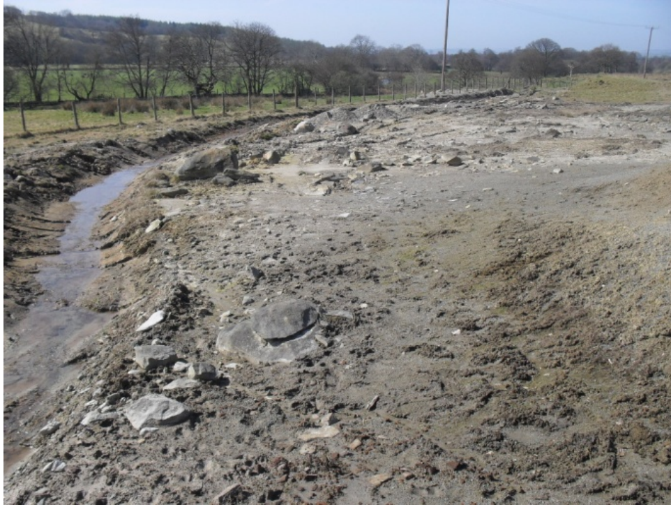
Figure 16 Ditch after it bends around the spoil area flowing in a westerly direction.