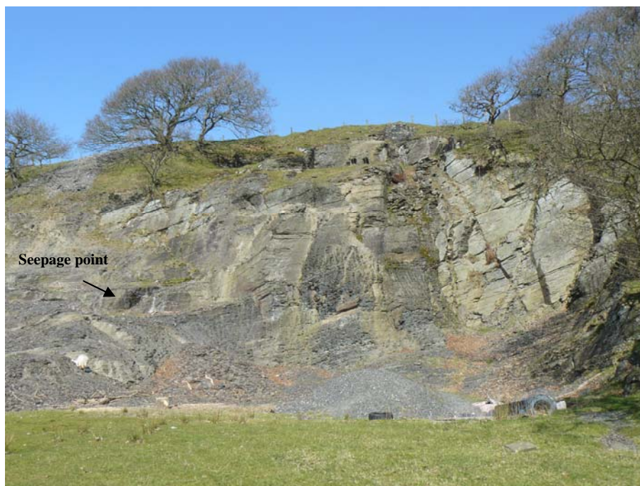
Figure 2 Bedrock exposed in the quarry to the north of the mine site

Bedrock was exposed in the quarry immediately to the north of the site (Figure 1) and could be seen to be bedded and jointed (Figure 2). Scour marks on the quarry face are suspected to be wire hose marks made during the removal of plant from the floor of the quarry.