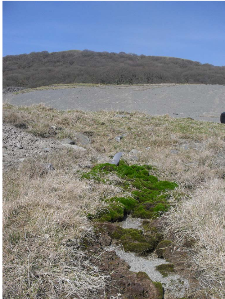
Figure 10 Seepage at the base of the spoil heaps colonised by lichens.