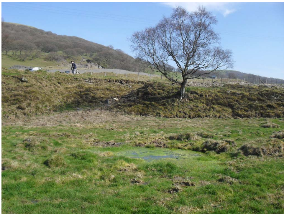
Figure 19 Floodplain receiving the drainage from Abbey Consols spoil heaps.