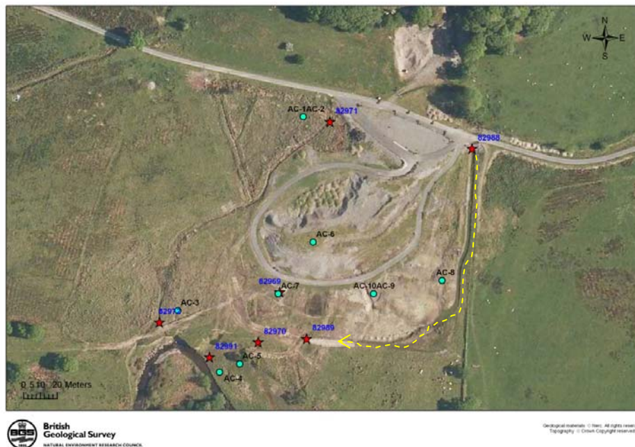
Figure 21 Aerial photograph of Abbey Consols Mine site with EA sampling locations (red stars) and samples collected during the site visit on the 29 th March 2012. Boundary ditch marked in yellow with direction of flow (Aerial photography © Getmapping Licence No. UKP2006/01).