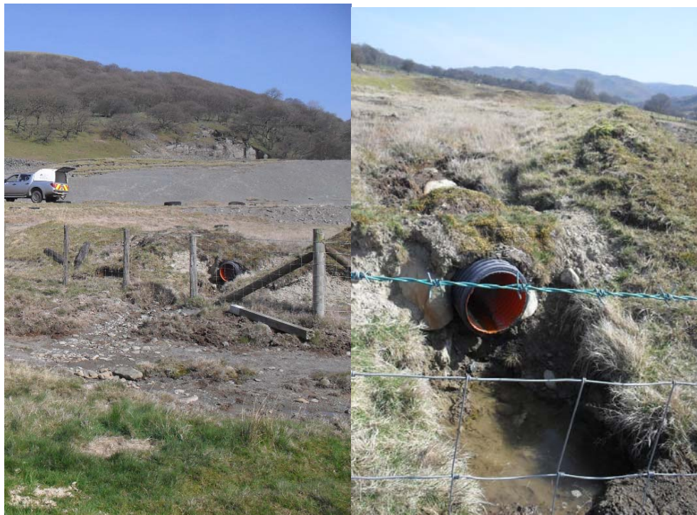
Figure 13 Pipe draining the area at the base of the spoil heaps, EA monitoring point 82970.

The presence of an issue near the old quarry area, north of the spoil heaps, at SN 7437 6618, as noted by ExCAL Limited (1999), may represent mine water issuing at this point, possibly entering the mine workings from the north-west area of the catchment. This water is sampled by the EA at SN 274378 266161, ID 82988 “ABBEY CONSOLS D/S ROAD” (Figure 14).