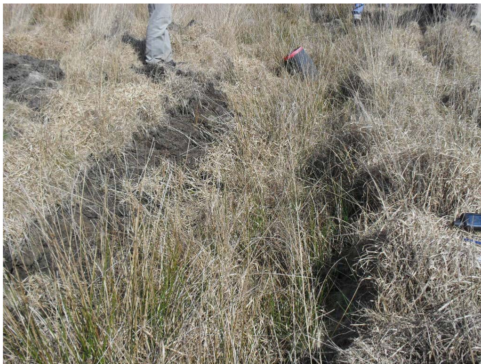
Figure 6 Peat underlain by bluish-grey silty clay in a marshy area to the west of the site (close to SN 74277 66181 in Figure 5).