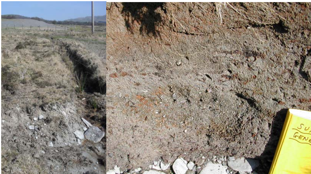
Figure 8 Alluvium, showing iron enrichment associated with seepage to the river.