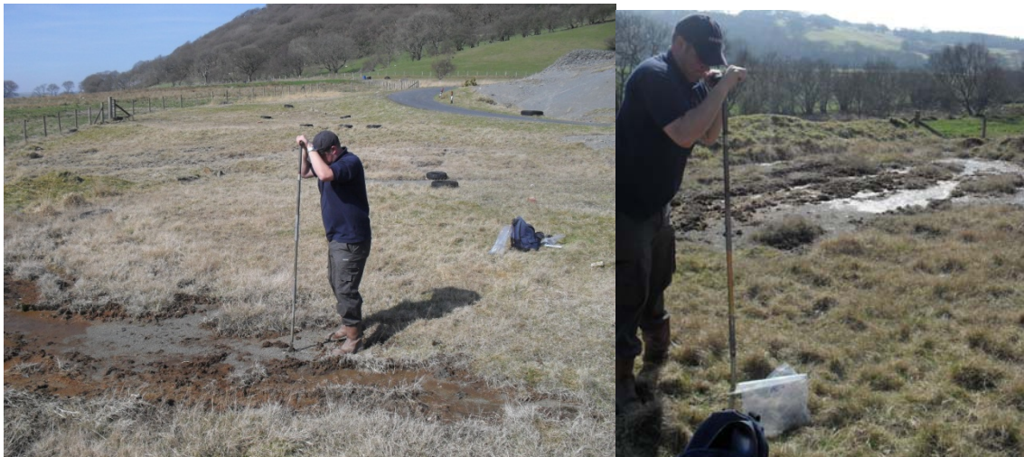
Figure 11 Collection of tailings sample (AC- 7) by hand auger in the marshy area downstream of the spoil heaps. Location is illustrated in Figure 21.