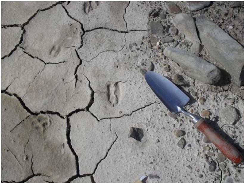
Figure 20 Desiccation cracks in the area SN 74319 66075 (sample AC-9).

During the site visit on the 29 th March evidence of desiccation cracks in the area SN 74319 66075 were visible, a sample AC-9 was collected from the 2-3 cm thick friable pale yellow fine silt crust over the tailings. Mineralogical analysis of the samples could indicate the type of metal salts present and inform on the quality of the potential surface runoff during the flush out at the first rainfall after a prolonged dry period.