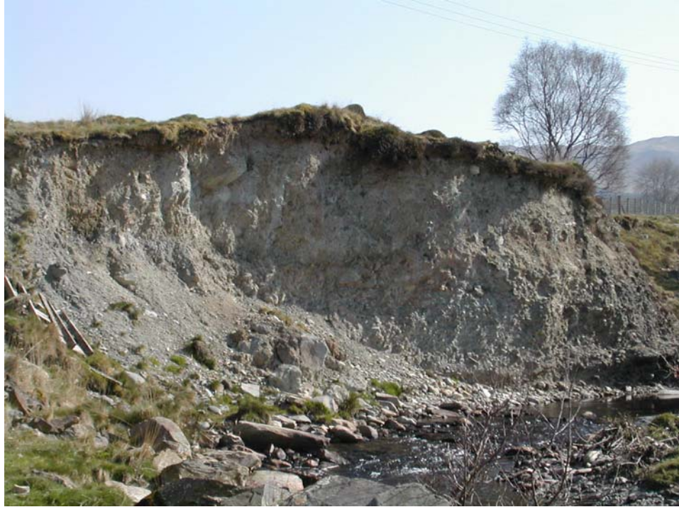
Figure 4 Exposure of Till.

Alluvium was encountered in two areas: i) the near surface soils associated with a spring line at the northern edge of the river flood plain and extending down-slope towards the river ii) adjacent to the river. The field immediately to the west of the abandoned mine area was covered by sedge-like grasses associated with these seepages. It was also exposed by hand augering at a number of locations (Figure 5), including SN 74277 66181 (Figure 6), where 0.80 m of medium brown soft to firm amorphous peat was underlain by soft (becoming firm with depth), bluish-grey silty, clay with occasional peaty rootlets extending to 1.40 m depth. Closer to the river the near surface alluvial soils were found to comprise firm grey silty clay with occasional yellowish brown staining and rootlets (SN 74202 66065) and about 20 cm of firm grey mottled reddish and orange brown silty organic clay river bank deposit (SN 74227 66028, Figure 8) overlying 55 cm of firm grey mottled brown and orange brown silty clay with pockets of fine to medium and occasional coarse gravel grade tabular clasts of mudstone resting on subangular to subrounded medium to coarse gravel and cobble grade tabular bedded gravels that grade into the river bed.