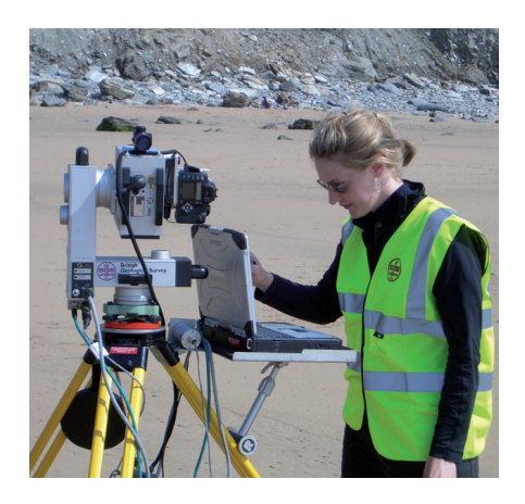
The British Geological Survey Terrestrial LIDAR equipment deployed in beach surveys.

An understanding of coastal morphology and sediment dynamics is especially