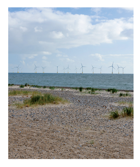
The Scroby Sands Wind Farm lying offshore of Great Yarmouth, Norfolk.

The Great Yarmouth coast has experienced significant morphological change during the Holocene including: