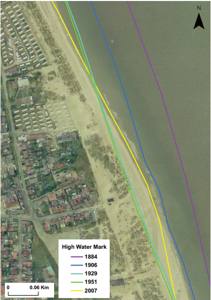
Mean high water positions at North Denes (top) and Caister-on-Sea (bottom), Great Yarmouth digitised from OS topographic maps.