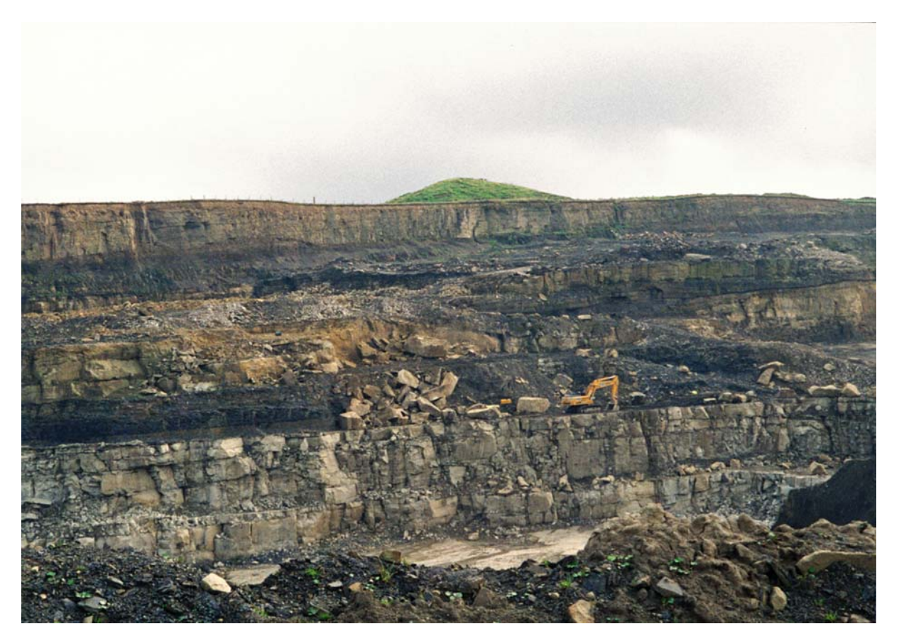
Figure 3. Fletcher Bank Quarry, Bury, Marshalls Natural Stone, producing concreting aggregates, crushed rock aggregate and walling stone.

The crushed rock aggregate resources of Greater Manchester are confined to Carboniferous sandstones which, whilst relative extensive, do not provide a source of high quality aggregate.