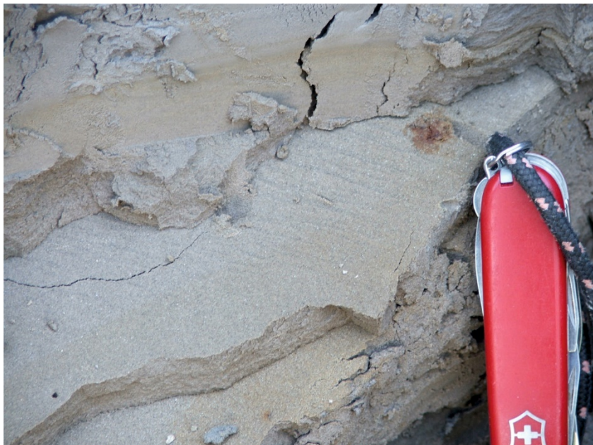
Figure 48. Possible primary current lineation on the bedding plane of an interbed of fine-grained sand within the Ardersier Silts Fm.

The exposed sequence comprises typically up to c. 1.5 m of compact, dark grey, sandy and clayey, thinly bedded to thickly laminated silt (Fig. 47 A). The silt contains thin discontinuous interbeds and partings of fine sand, some of which show fine horizontal lamination; traces of small-scale ripple lamination are also present. Possible primary current lineation (NNW-SSE) are present on the upper bedding planes of some of the thicker (2-3 cm thick) sand interbeds (Fig. 48). The silts are weathered to olive grey to a depth of c. 0.6 m beneath the top of the cliff.