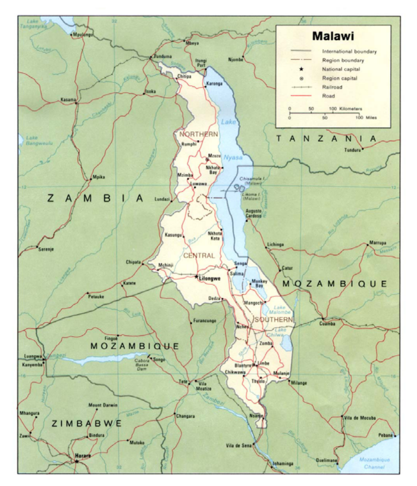
Figure 1. Map of Malawi and neighbouring countries (courtesy of The General Libraries, The University of Texas at Austin).

areas are gently undulating peneplains with broad valleys draining toward the Rift Valley (UN, 1989). 'Dambos', broad areas of grassy swampy ground subject to flooding, occupy many parts of the plateau. The uplands include the Mlanje, Zomba and Dedza mountains (highest point at Sapitwa, Mount Mlanje, 3002 m) and the Viphya and Nyika uplands. The escarpment consists of parallel faults running down to the Rift Valley floor. The lowland plains extend along the shores of Lake Nyasa and the valley of the Shire River, which runs south from Lake Malawi to join the Zambezi River in Mozambique. Elevation in Malawi descends to 37 m at the Mozambique border. The Linthipe,