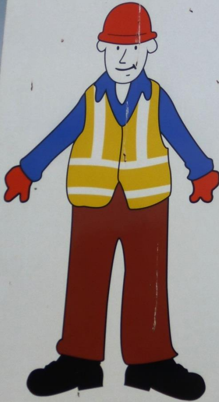
VISITOR / EX WORKS

PLEASE COULD YOU ENSURE THAT YOU MEET THE MINIMUM PPE REQUIREMENTS AS SHOWN BELOW WHILST ON SITE