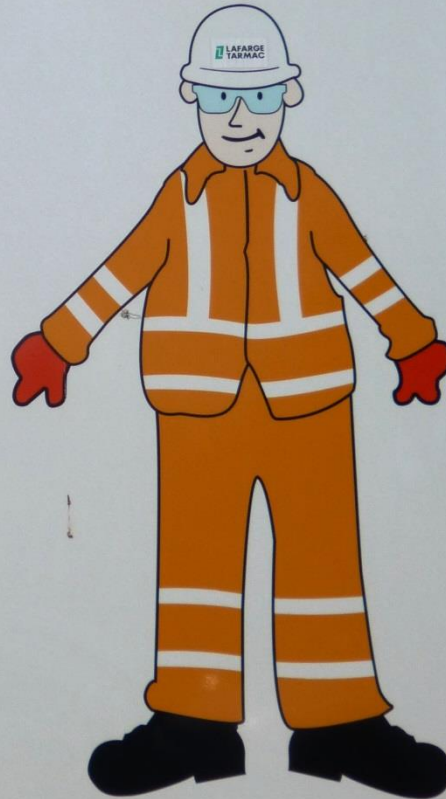
CONTRACTORS / EMPLOYEES

Thank you for helping to keep Kingsley Quarry a safe place.