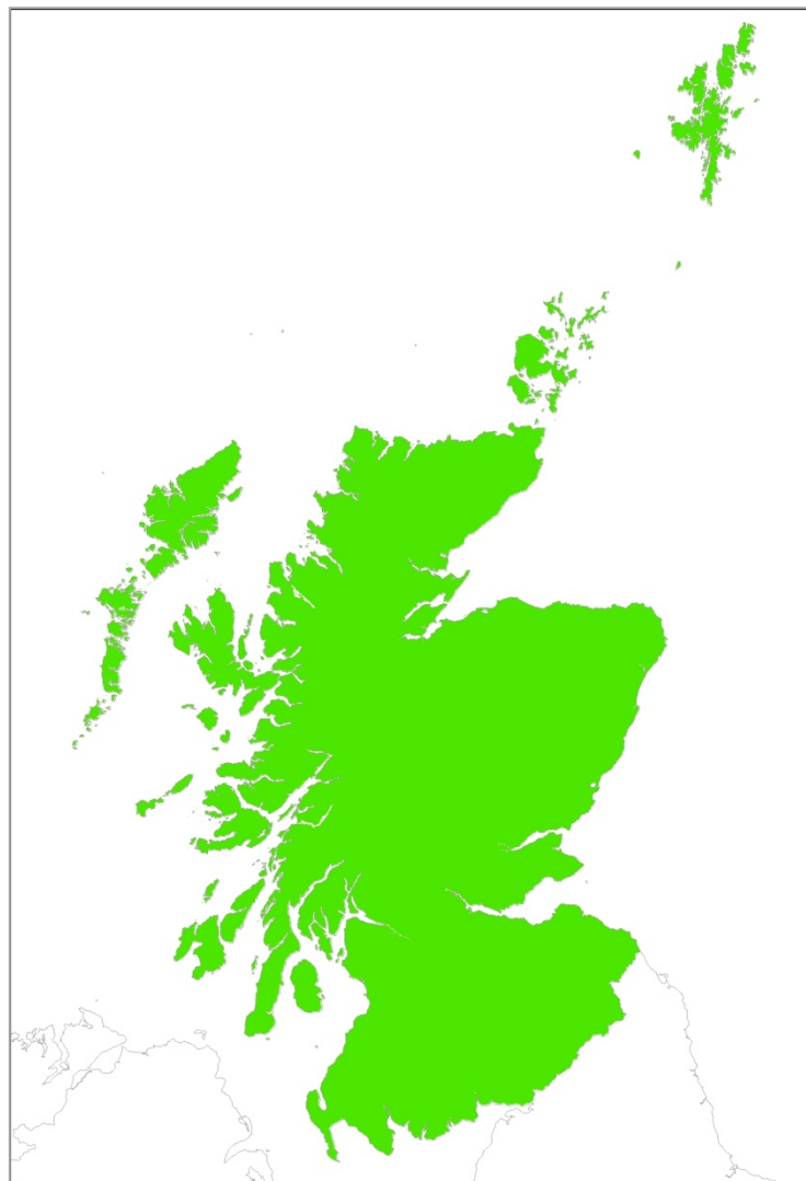
Figure 2 The coverage of the groundwater vulnerability (Scotland) dataset