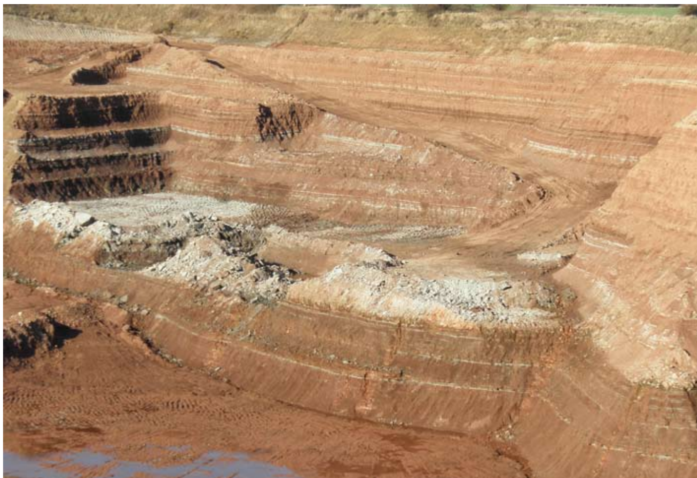
Current extraction of brick-clay from the Mercia Mudstone at the Ibstock quarry.

Fields (also known as Knighton Junction brickworks); they have long been filled in and re-developed. The University of Leicester student flats (Nixon Court), close to the Homebase store, cover the eastern brick-pits. South of the railway junction there was another brick works on Saffron Lane.