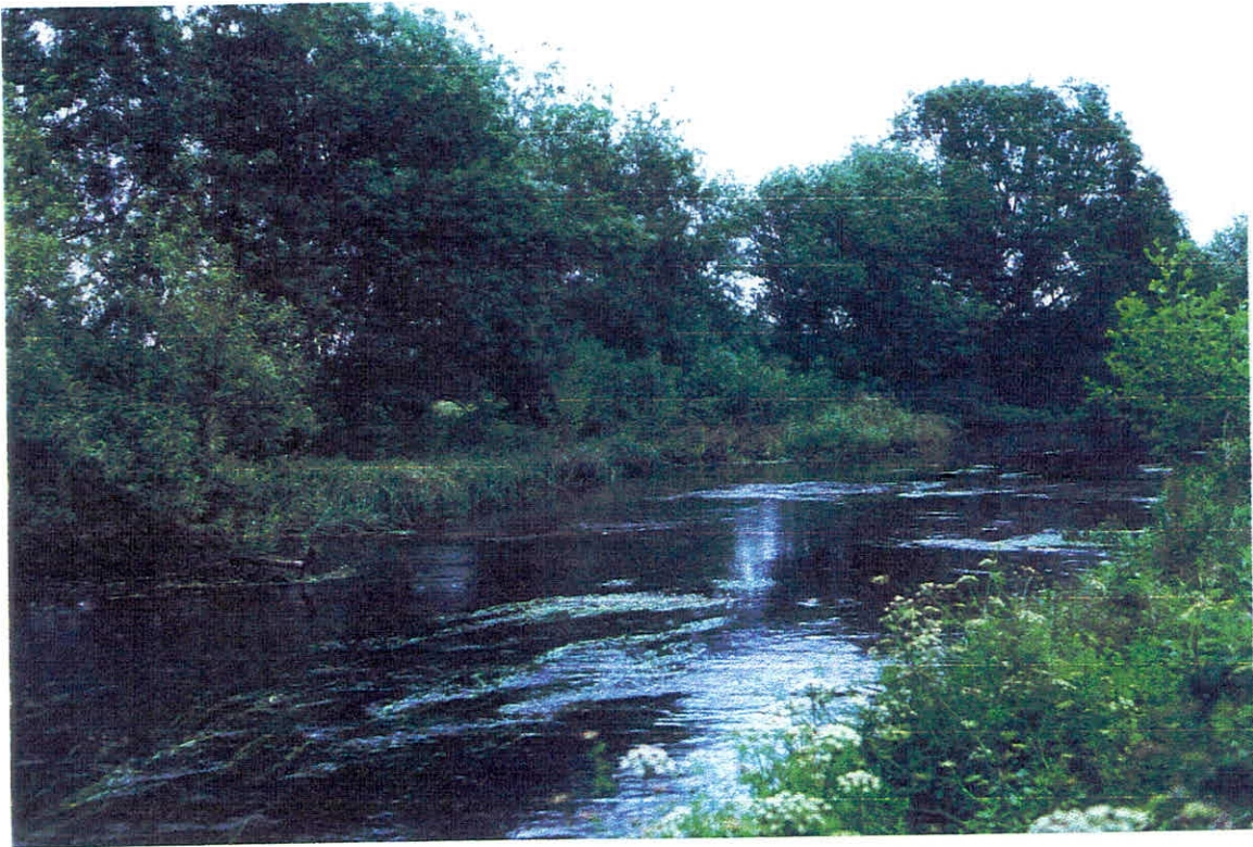
Figure 3.3 c) R. Kennet at Savernake (upper). June 1998. View downstream