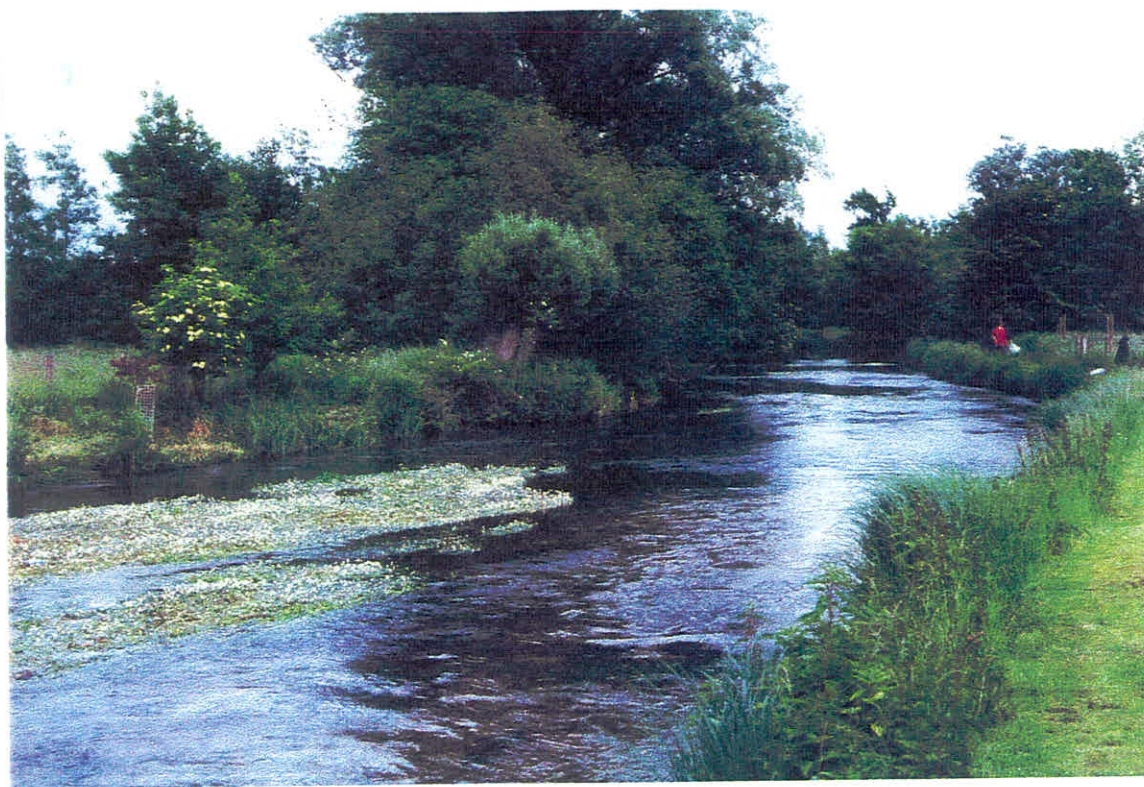
Figure 3.2 a) R. Kennet at Littlecote. June 1998. View downstream from the top of the 100 m site