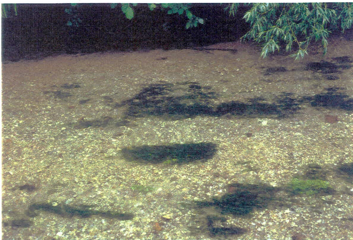
Figure 3.1 c) R. Lambourn at Bagnor (shaded site). June 1998. Ranunculus beds