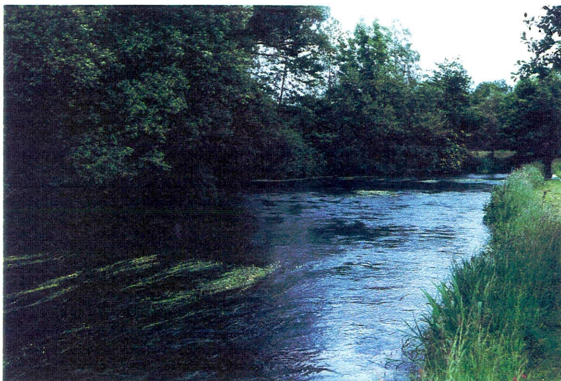
Figure 3.2 b) R. Kennet at Littlecote. June 1998. View downstream from the middle of the 100 m site.