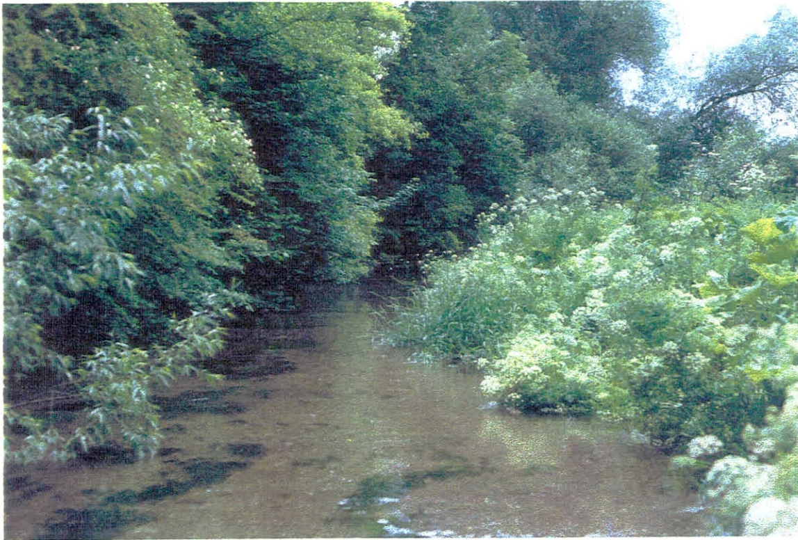
Figure 3.1 a) R. Lambourn at Bagnor (shaded site). June 1998. View upstream