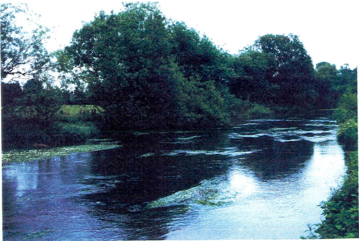
Figure 3.3 d) R. Kennet at Savernake (upper). June 1998. View downstream