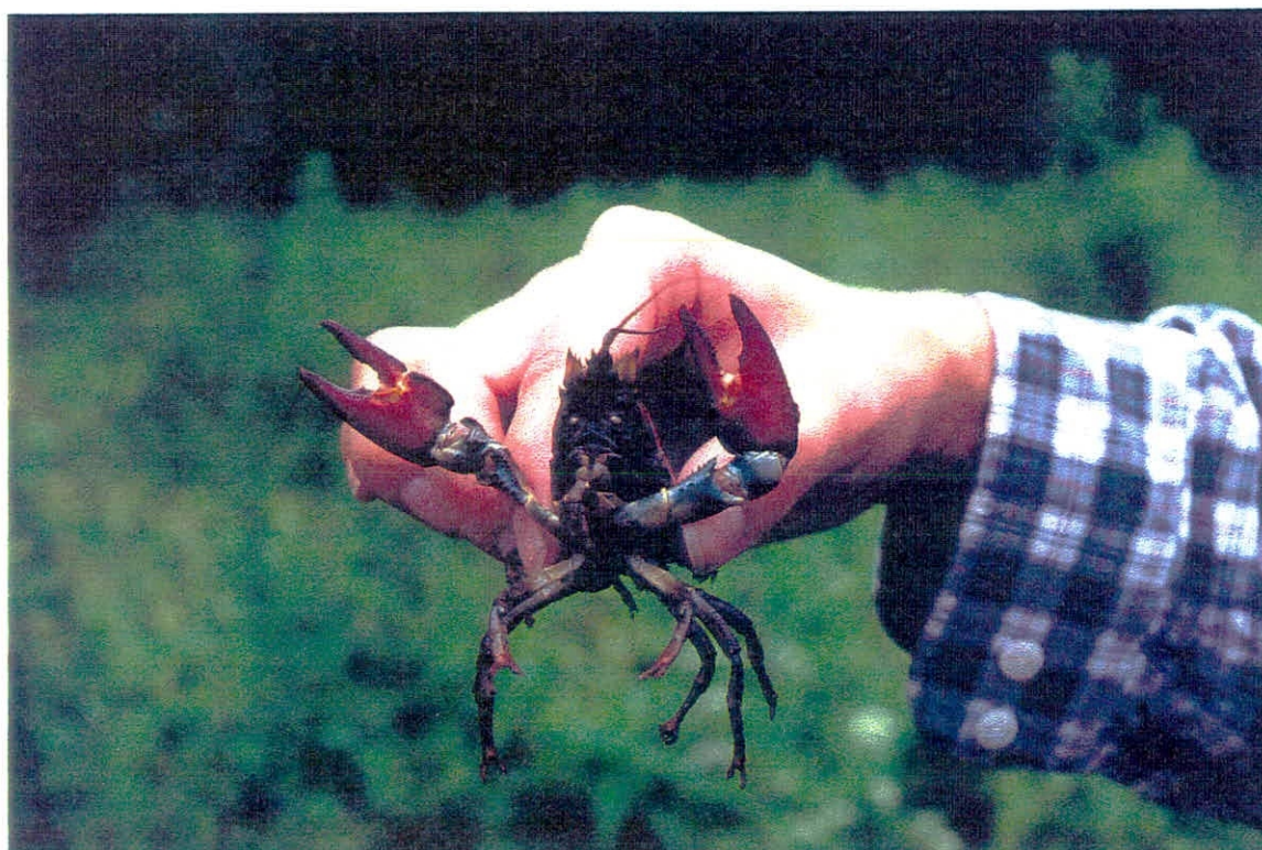
Figure 3.1 d) R. Lambourn at Bagnor (shaded site). June 1998. The signal crayfish ( Pacifastacus leniusculus )