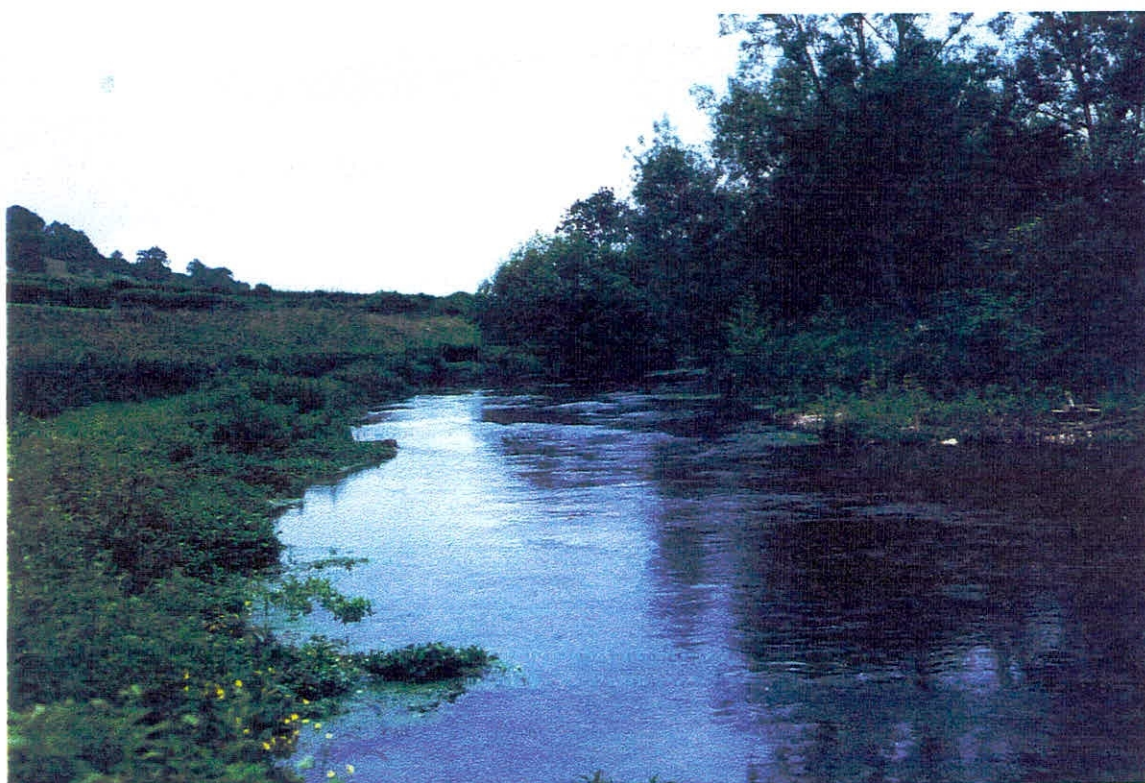
Figure 3.3 a) R. Kennet at Savernake (lower). June 1998. View upstream