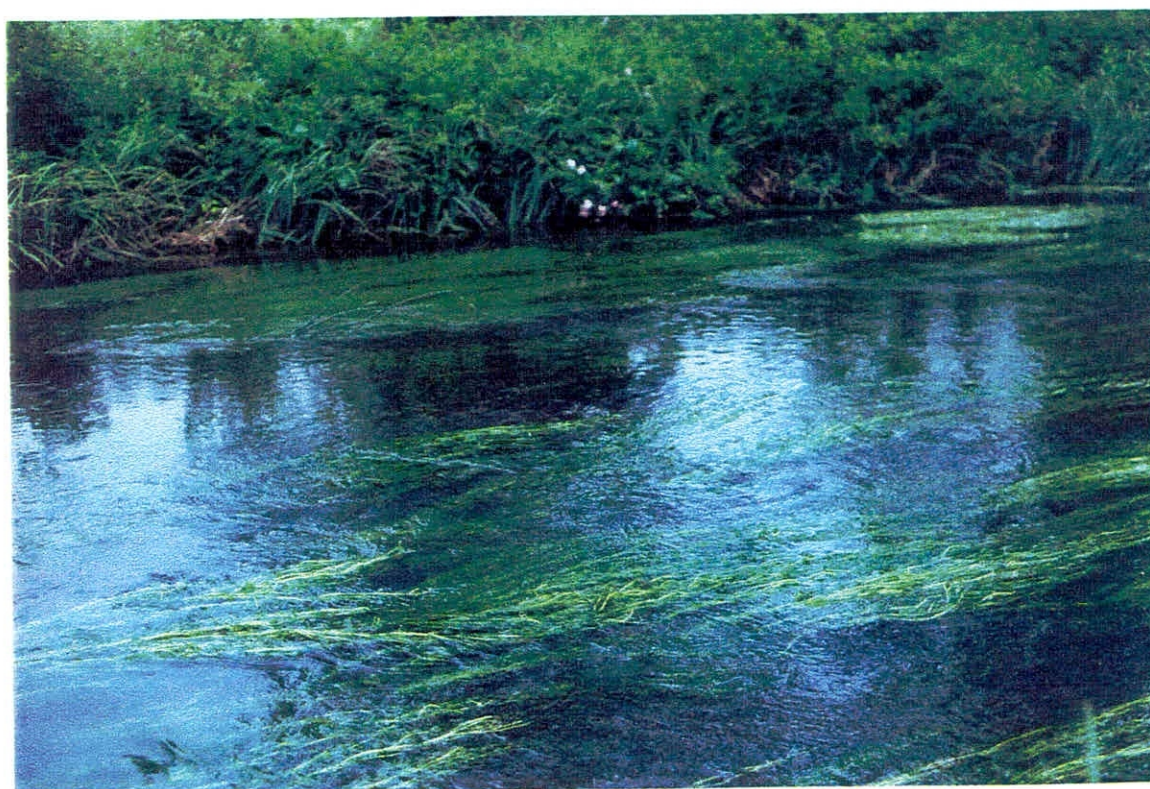
Figure 3.3 b) R. Kennet at Savernake (lower). June 1998. Ranunculus beds