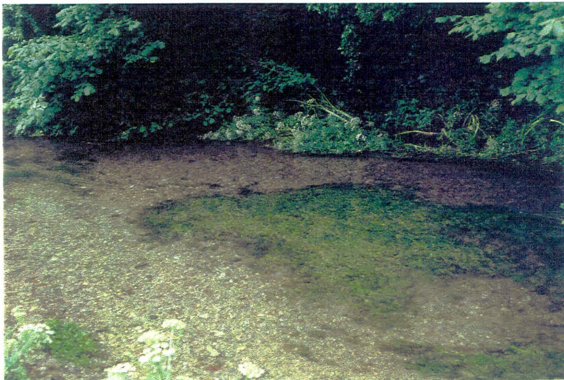
Figure 3.1 b) R. Lambourn at Bagnor (shaded site). June 1998. Carpet of Berula