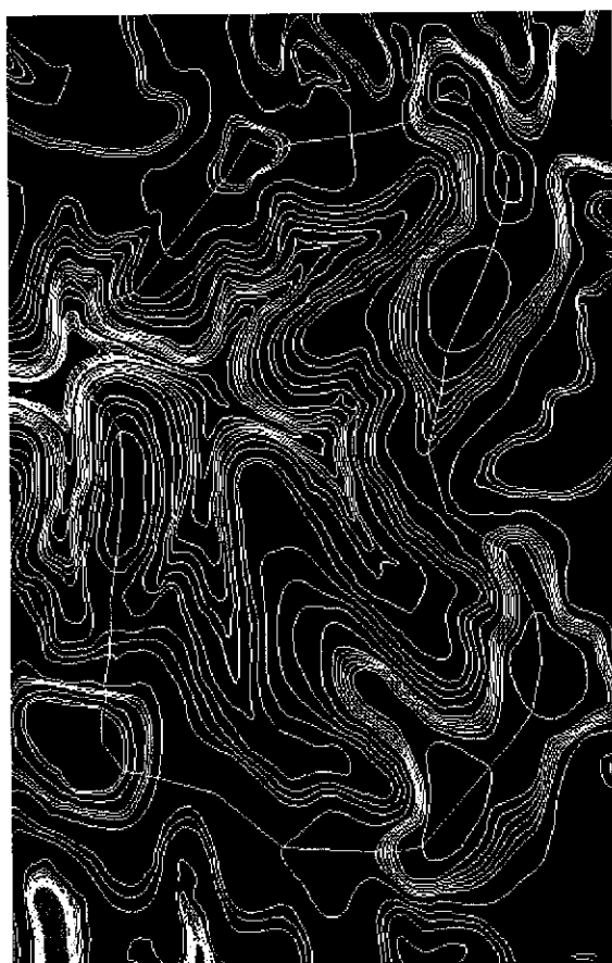
Figure 1 Topography of full catchment with area of study marked.