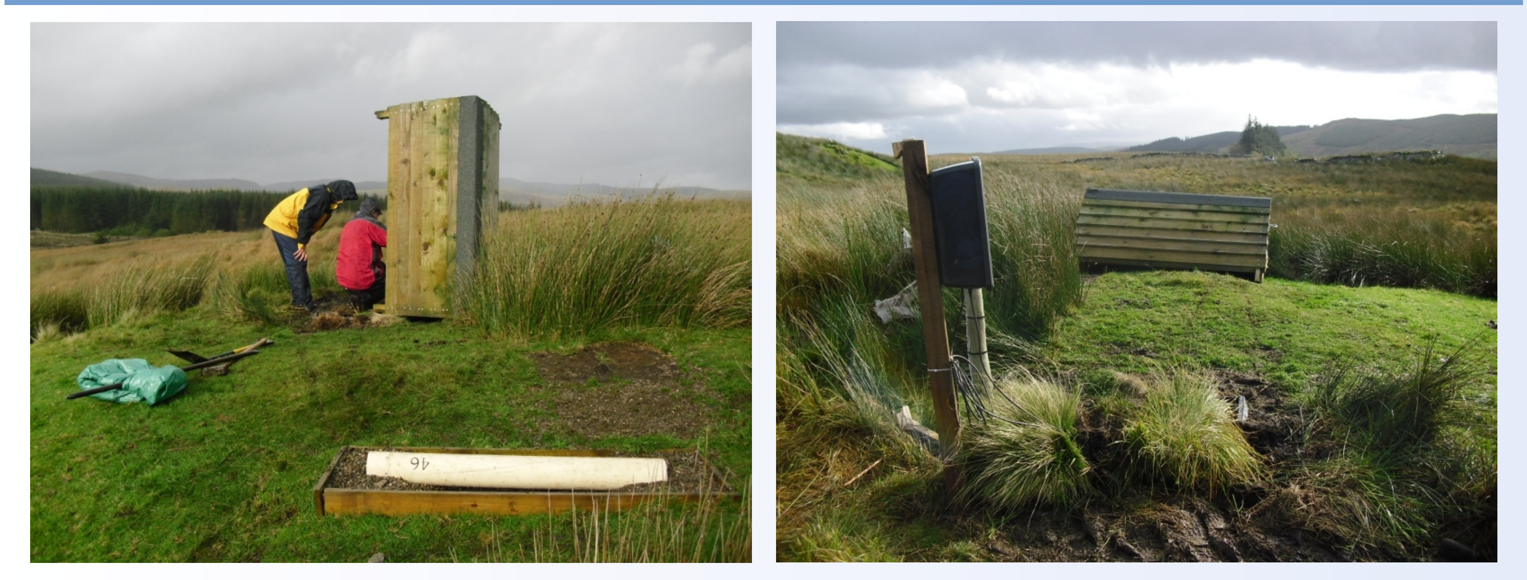
Figure 1: Installation of Channel 1 (North) induction coil at Eskdalemuir [55.314° N, 356.794° E] in the Scottish Borders, UK. Left image: The coils (white tube, foreground) are located in a rural valley (background), protected from wind, rain and snow under a non-magnetic wooden cover (shown upright in midground). Right image: Looking eastward to the enclosed coil under wooden cover. The signal is digitized close to the coil before being converted to a higher voltage at a breakout box (mounted on the post) and sent to a logging computer in a vault approximately 150m away not shown).

There are a number of features in the data that BGS wish to investigate, including the diurnal and seasonal variation of the Schumann resonances. For example, it has been suggested that lightning activity is related to climate variability [3]. We will look for solar cycle and climate variations in both the ionospheric and magnetospheric signals. It will also be interesting (over the long term) to compare Schumann resonance amplitude/width data with other measures of geomagnetic variability measured at longer time scales by other magnetometer measurements eg. to see where the power in the spectrum lies and how it relates to source mechanisms.