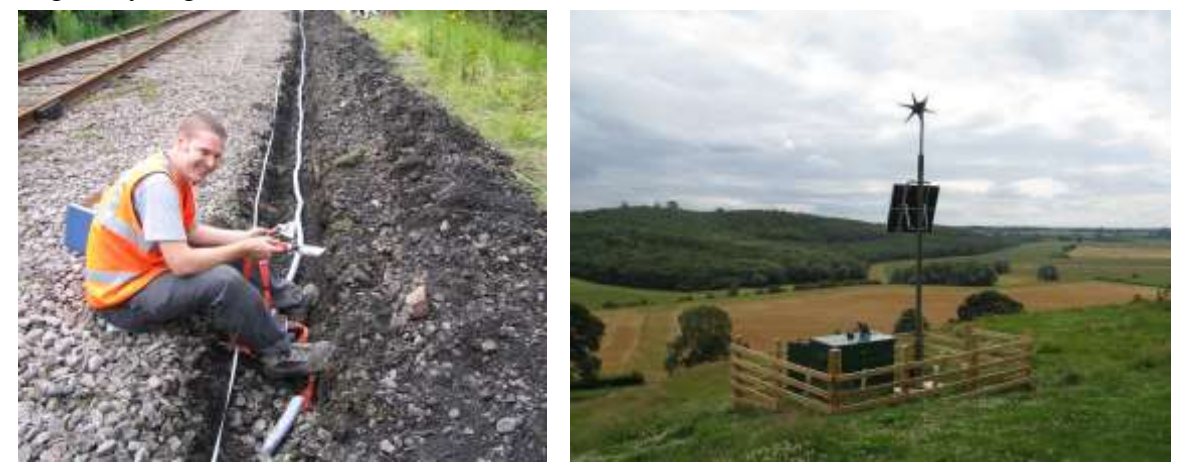
a. Retro-fitting electrode arrays for electrical resistivity imaging.

properties crucial to stability as they occur in full space, and in real time. The technology will have to be retro-fitted on a case-by-case basis because aged earthworks have unique heterogeneity engineered in.