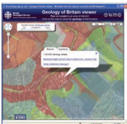
The Geology of Britain web viewer (showing detailed 1:50,000 scale geology for the British Geological Survey headquarters in Keyworth, Nottingham) is underpinned by the same web map services as iGeology.