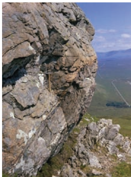
The Glencoe Boundary Fault, Stob Mhic Mhartuin, Lochaber.