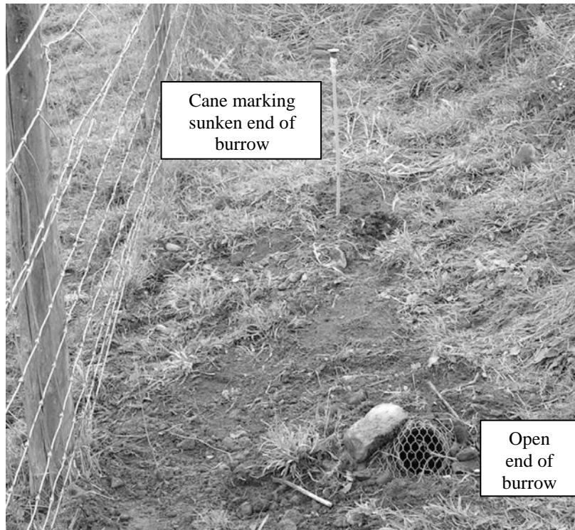
Figure 1. Artificial burrow at Site 2 immediately after being set-up.