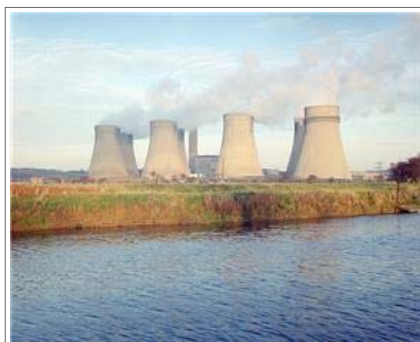
CO 2 from coal power stations may be captured for storage underground.

Although renewable and nuclear energy sources should meet a large proportion of our energy demands, there will still be a reliance on coal power stations. The UK Low Carbon Energy Plan estimates 22% of our energy will be supplied by coal in 2020. In order to make coal a viable low carbon option, power stations must be designed and built to harness carbon capture and storage (CCS) technology. The storage of supercritical CO 2 in deep offshore geological formations is still in the development stage but research into the technology has been on-going since the 1990s. However, assessing the impact of carbon sequestration in deep offshore formations on onshore groundwater systems has only been considered more recently. Pressure build-up at the injection site will be significant and could be equivalent to 200 to 500 metres groundwater pressure head . Dissipation of the pressure wave away from the injection zone through the storage formation or overlying horizons could cause increased groundwater pressure heads at considerable distances. The potential exists for increased