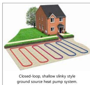
Closed-loop, shallow slinky style ground source heat pump system.

Geothermal energy is produced from heat stored in the earth originating from when the Earth was formed, from radioactive decay of minerals and from solar energy absorbed at the surface. Although there are deep hydrothermal reservoirs beneath the UK from which hot groundwater (70-90°C) can be harnessed, the majority of geothermal schemes in the UK are small scale and completed at shallower depths. With these, either groundwater is pumped from which energy is extracted or a conducting fluid is heated as it passes through a closed loop of pipework buried in the ground. Heat exchangers at the surface allow the heat to be removed. These systems, known as ground source heat pumps (GSHP), can also be used for cooling during summer months when the ground temperature is lower than the surface air temperature. GSHP systems are used for cooling within the Royal Festival Hall, London