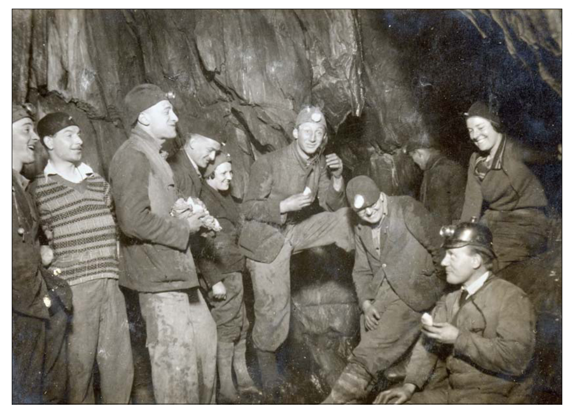
Time for a break in the Vestry, part of the New Roof Traverse route in Lost John's Cave, Easter 1932, [Image No.P617264 from the first album of the H W Haywood Collection].

An inscription in the front of the album gave the photographer's name as H W Haywood, of 8 Portland Crescent, Leeds, and also