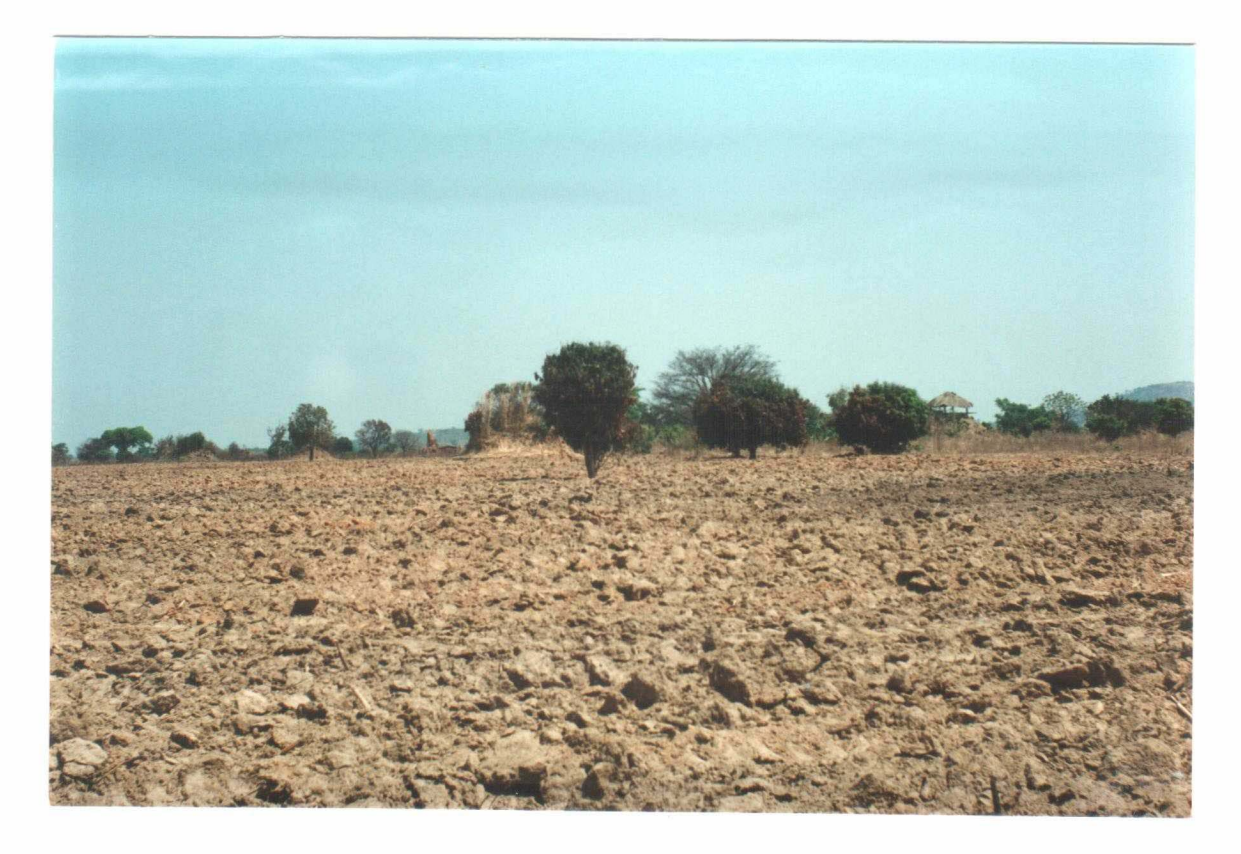
Plate 1. Farmland after application of agricultural lime (Mr Mwandira, Ndola, Zambia)