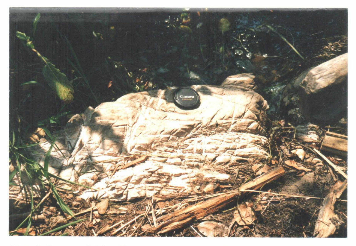
Plate 5. Outcrop of dolomitic marble on the banks of the Luapula River, Matanda, Zambia