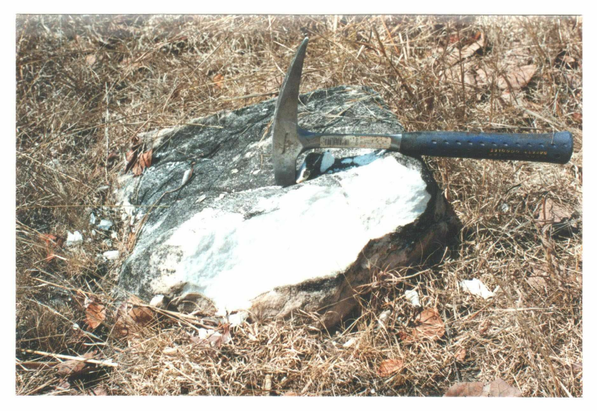
Plate 4. Exposure of dolomitic marble, Chivuna, Zambia