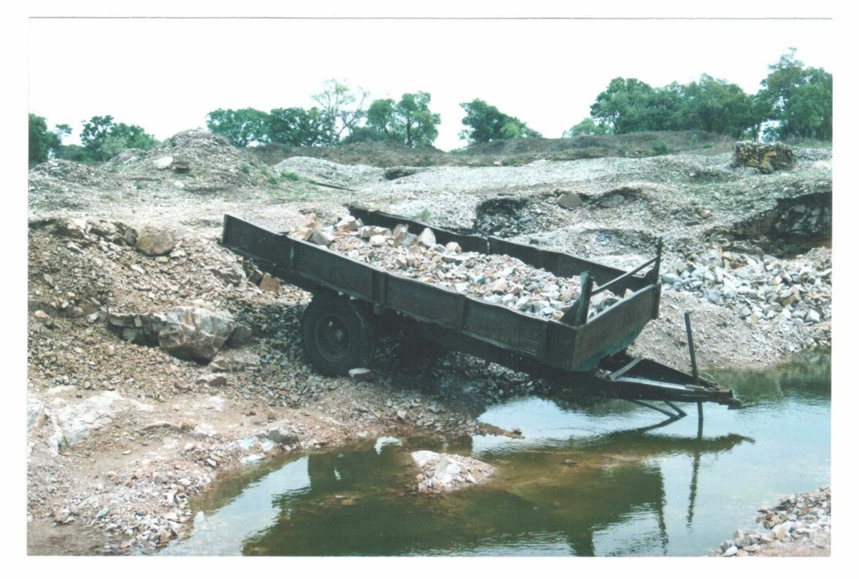
Plate 2. Opencast limestone quarry, Lilyvale Farm, Kabwe, Zambia