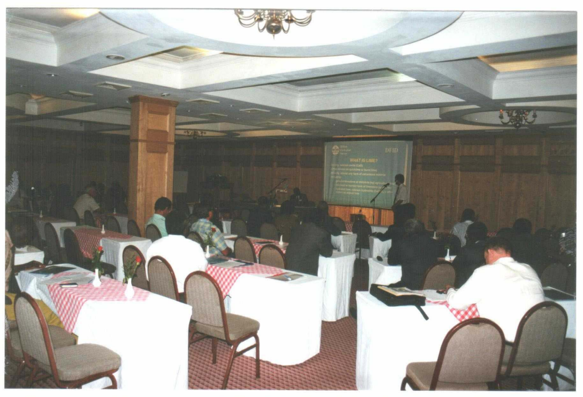
Plate 8. Local development of affordable lime in Southern Africa Workshop, Pamodzi Hotel, Lusaka, Zambia