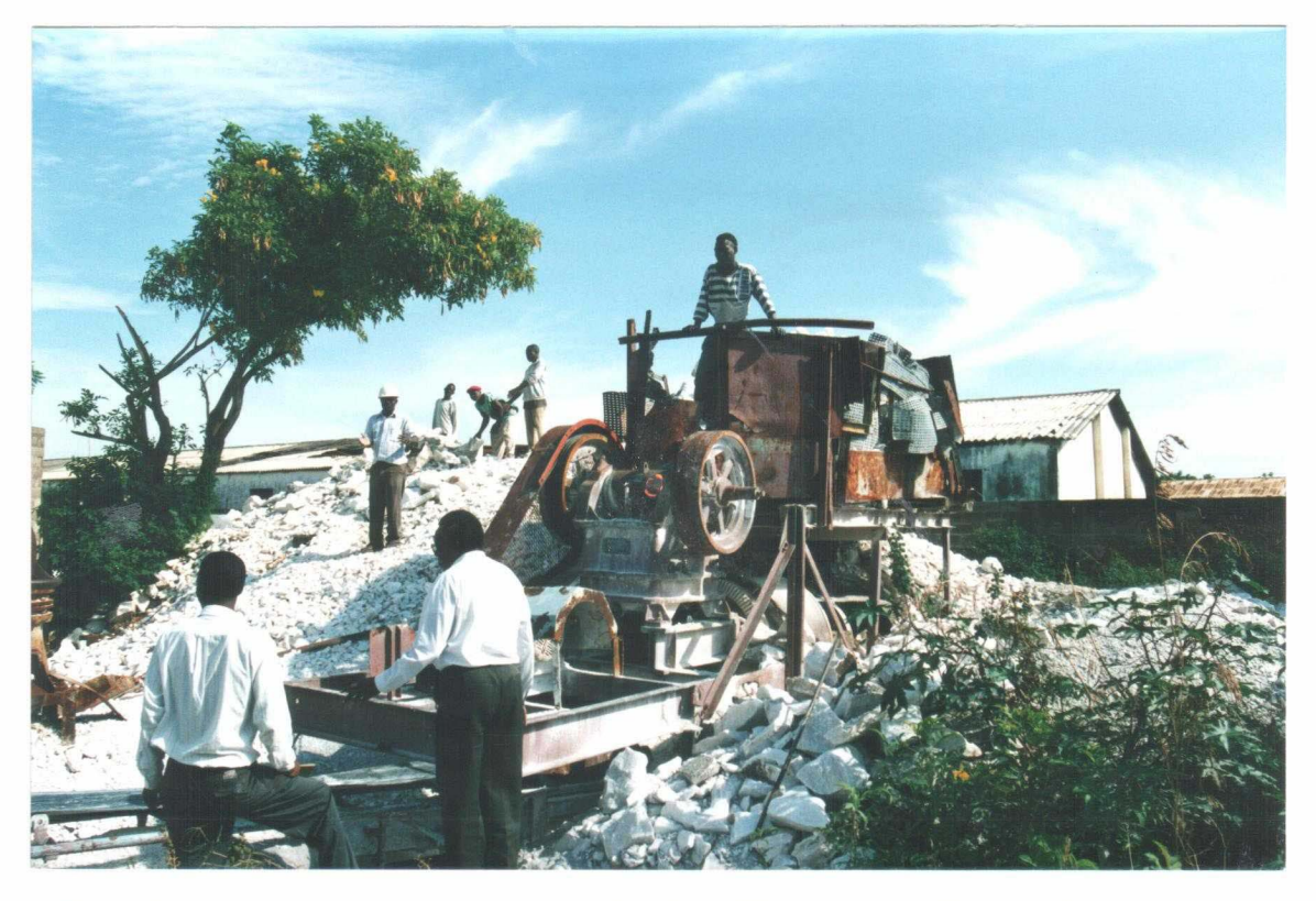
Plate 3. Small-scale ground lime production, Mindeco Small mines Ltd, Lusaka, Zambia