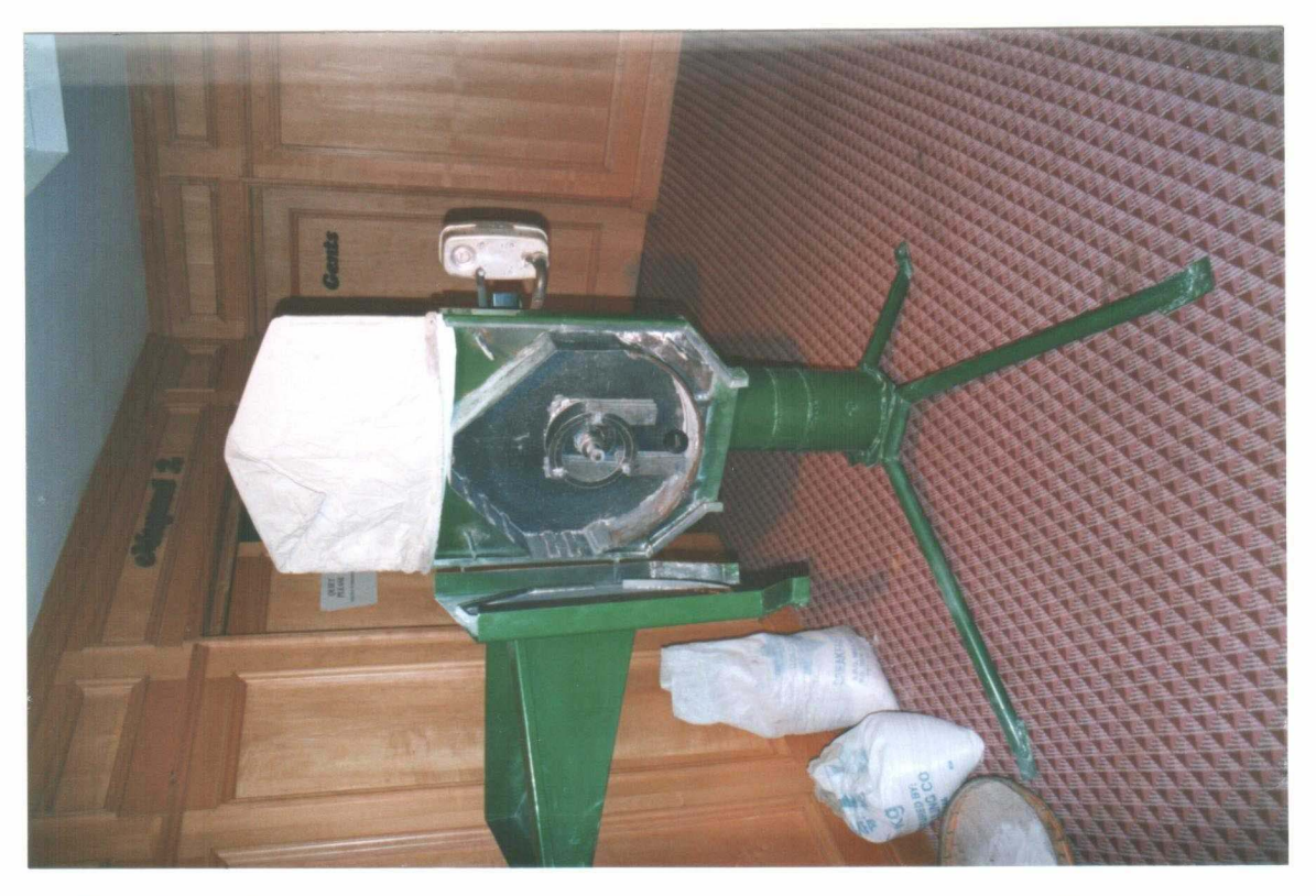
Plate 7. TD hammer mill, as used in lime production trials by the Technology Development & Advisory Unit (TDAU), Lusaka, Zambia