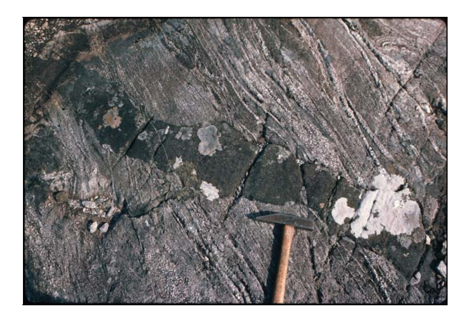
Figure 1: A dark-coloured Younger Basic dyke cutting across banded grey Lewisian gneisses, near Loch Leosaid, North Harris.

As the continental crust continued to stretch, eventually it split, and magma welled up to the surface to form the floor of a new ocean. However, by 1900 million years ago, the ocean had ceased to open and instead was closing, with ocean floor material sinking beneath the continent at a subduction zone. Material in the subduction zone melted to produce magma, and this magma rose to the surface to be erupted, forming chains of volcanic islands. Although these islands consisted largely of volcanic rocks, sedimentary rocks (including mudstones and limestones) were deposited around their fringes.