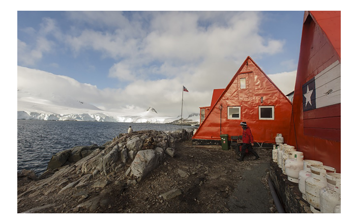
FIGURE 1 Yelcho Station on the shore of South Bay, Doumer Island, west of the Antarctic Peninsula coast.

Moth legs were removed to extract DNA using the saltingout method (Aljanabi & Martinez, 1997). The mitochondrial cytochrome c oxidase I (cox1) gene was amplified using universal primers LCO1490 and HCO2109 in a total of 30 µL of mix containing PCR buffer 1× (200 mM Tris-HCL pH 8.4, 500 mM KCl), MgCl<sub>2</sub> 2 mM, dNTPs 0.16 mM, Forward and Reverse primers 0.1 µM, Taq DNA Polymerase (Invitrogen<sup>™</sup>) 0.03 U/µL and DNA 1 ng/µL (Folmer et al., 1994).