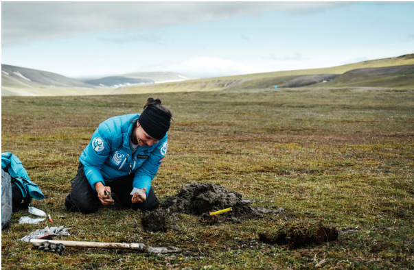
Fig. 1 The author collects soil samples in Rosenbergdalen, on the island of Edgøya, Svalbard, on one of the occasions that she was able to do field-work during the 2022 SEES expedition.

how to use, a rifle. But, overall, scientists and tourists visited the same places, took part in Zodiac excursions, and mingled in the ship's dining room and bar.