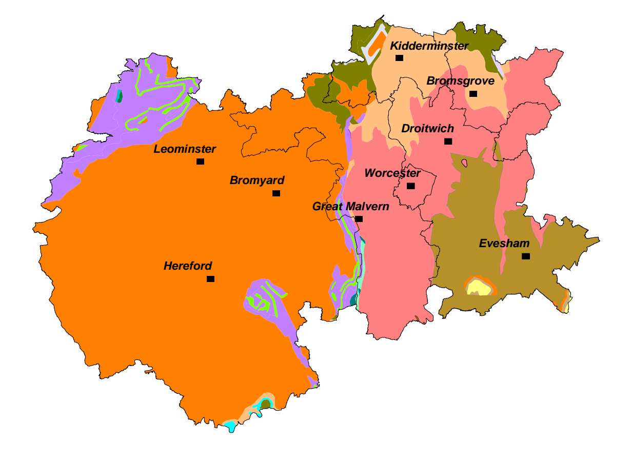
Figure 1 Simplified geological map of Hereford & Worcester. Key relating mineral commodities to geology is shown on the next page.