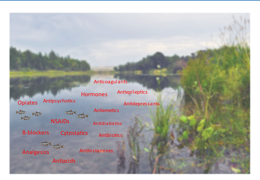
FIGURE 2: A simple illustration to demonstrate that aquatic organisms are simultaneously exposed to many different pharmaceuticals.