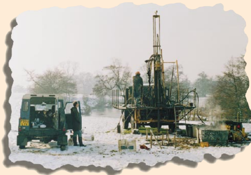
MRP drilling for MVT replacement-style mineralisation in the Southern Pennine Orefield.

Along the trace of the Variscan Front in southern England, Dinantian limestones are unconformably overlain by Mesozoic rocks on the northern margins of the Wessex Basin , while to the west Dinantian strata outcrop in the Mendip Hills and in South Wales . In some of these areas, especially in the Mendip Hills, the limestones contain vein, replacement and disseminated lead-zinc MVT mineralisation of Mesozoic age. Base-metal mineralisation also occurs in several boreholes in the Wessex Basin at the Mesozoic–Dinantian unconformity. There are several major Jurassic growth faults in the area, providing a focus for mineralising fluids from the Wessex Basin. A concealed Tournaisian Waulsortian reef complex (similar in age to those hosting some of the Irish zinc-lead deposits) occurs some 30 km south-west of the Mendip Hills, near Bridgwater. There is thus potential for concealed lead-zinc mineralisation in structural and stratigraphical traps in both Carboniferous and Jurassic rocks along the line of the Variscan Front.