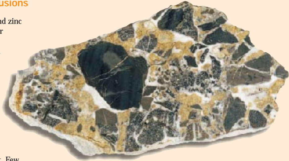
Sphalerite breccia vein from the Cwmystwyth mine in the central Wales orefield, showing angular fragments of black mudstone wallrock cemented by quartz and honey-brown sphalerite.

The main production of lead and zinc in the predominantly tin-copper mining area of South-west England was from north-south 'crosscourse' veins cutting the earlier major east-west tin-copper veins. Total production from the area was around 250 000 t of lead and 50 000 t of zinc. The lead and zinc tend to occur on the margins of the main mineralised districts. The galena is generally silver-rich, averaging around 1200 g/t. Few of the major east-west tin-copper veins produced lead or zinc, but zinc was produced as a co-product of tin production at the Wheal Jane mine at the rate of 6000 t per year until the mine's closure in 1991.