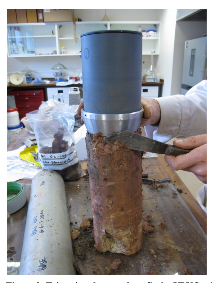
Figure 2: Trimming the sample to fit the UPVC tube.

The plastic sample liner was cut from the sample using a vibrating saw rig at the BGS Core Store labs. This produced less sample disturbance than extrusion of the sample by piston. The plastic (UPVC) sample tube was then greased on the inside with silicone grease, in order to fill any voids between the sample and the inside of the tube, and weighed. The tube was made from UPVC as this material is non-conductive and could be later retrofitted with electrodes for geophysical work on the sample. A chamfered metal cutting shoe (produced in the BGS workshops) was fitted to the tube to help with the cutting as shown in Figure 2. The sample was trimmed down with a sharp blade as the tube was pushed down over the sample in small increments, using a block of wood to keep the pressure more evenly distributed, to produce a specimen that fitted tightly in the tube (Fig 2). It was essential to produce a tight fit in order to prevent leakage of water between the specimen and the tube.