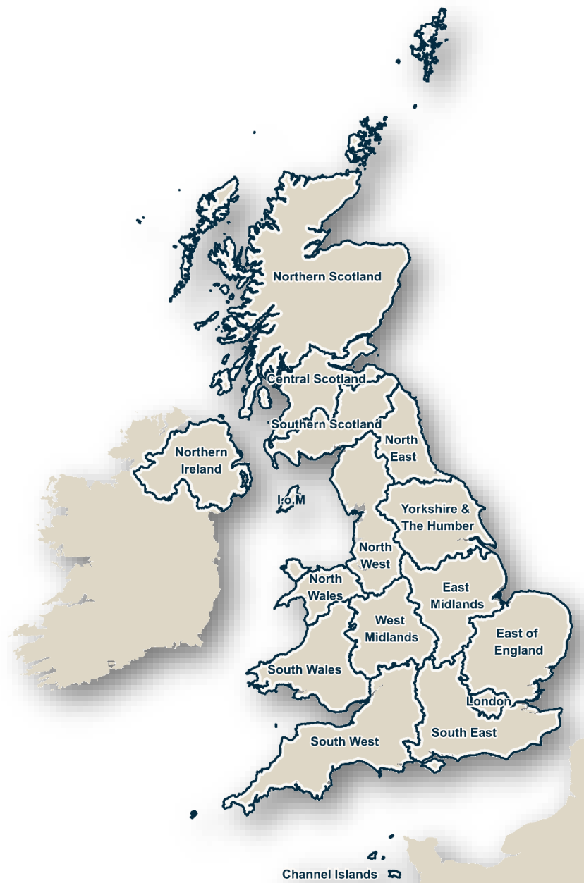
Figure 2 BGS BritPits regions

The full dataset includes all the entries (over 250,000) of the BGS BritPits database, including historic sites. The data are split into 17 regions (Figure 2) but for licencing purposes is supplied as 15 regions (Isle of Man is supplied with Northern Ireland, Channel Islands are supplied with South West England) and supplied as a Microsoft Excel file and/or GIS point layer.