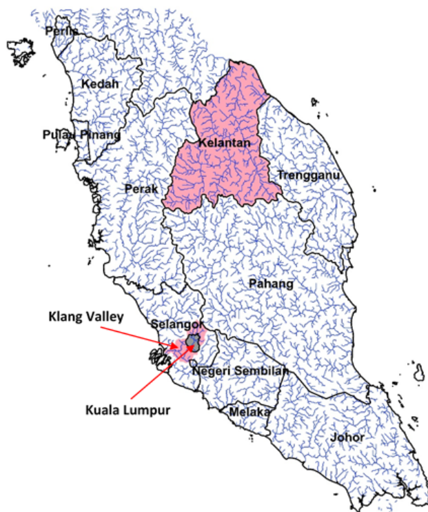
Figure 4. Map of Peninsular Malaysia showing federal states (delineated by black lines) and a 1km resolution river network (blue line). FIAS case study areas are highlighted in pink, and the city of Kuala Lumpur is shaded in grey.

by data from local authorities, newspaper reports and NGO sources, will provide information on the socio-economic impact profiles of previous flood events of different magnitudes and durations. Tangible impacts will be estimated and intangible impacts qualitatively assessed. This information will be used to define a typology of linkages between floods, impacts and damages, and thereby identify critical flood depth thresholds leading to impacts. It will also provide new knowledge of community response to floods events and factors that influence mitigation behaviour and contribute to the evidence base for social learning. Upscaling from case-study scale to national scale will take place through innovative coupling of local information about flood exposure and vulnerability, and associated damages, with national-scale geophysical and socio-economic datasets.