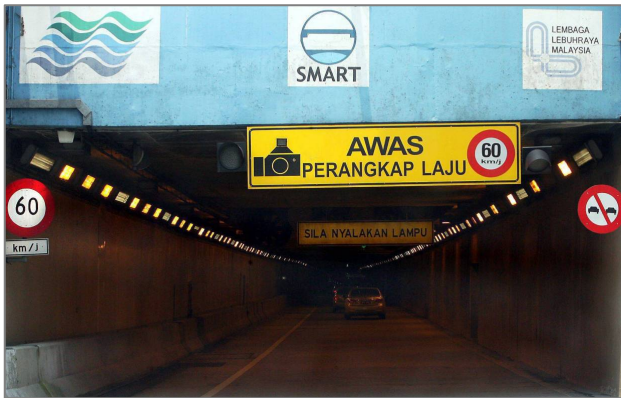
Figure 2. The Entrance of SMART Tunnel ( The Star , 2019).

Continuous monitoring of water levels at stations across the country is essential for real-time management of flood risk and for longer term studies of trends and environmental change. Monitoring of flood extent and depth is undertaken by DID, and provides a valuable initial condition for pathway assessment of areal flood hazard (e.g. Abdullah et al., 2012), as well as real-time flood warning, such as the National Flood Forecasting and Warning System (NaFFWS) implemented in several major river basins as a collaborative initiative between DMM and DID (DMM, 2017).