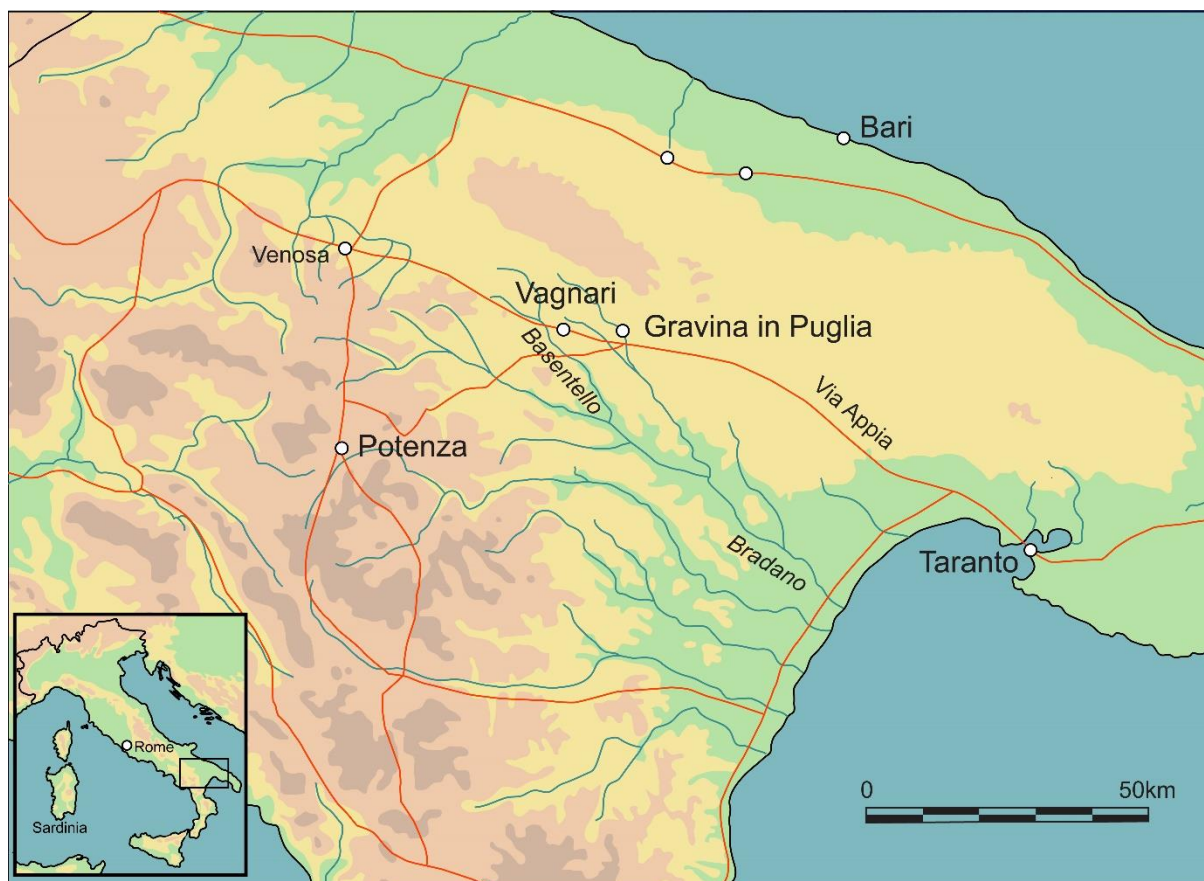
Fig. 1 Map of south-east Italy showing the location of Vagnari (drawn by Irene De Luis).

Field-walking, survey, and excavations about 75 km west of the Adriatic coastal town of Bari in Italy revealed a Roman village ( vicus ) and an associated cemetery at Vagnari in ancient Apulia that was occupied from the early first to the fourth century CE (Small 2011; Brent and Prowse 2014; Carroll 2014; Carroll 2019; Prowse et al. 2014) (Fig. 1). Ceramic roof tiles at Vagnari and in the vicinity, that were stamped with the name of an imperial slave, indicate that this settlement was a central part of a very large rural estate belonging to the Roman emperor and operating as a source of revenues. The period between the late first and the end of the third century CE was the most active and productive phase of occupation in the vicus .