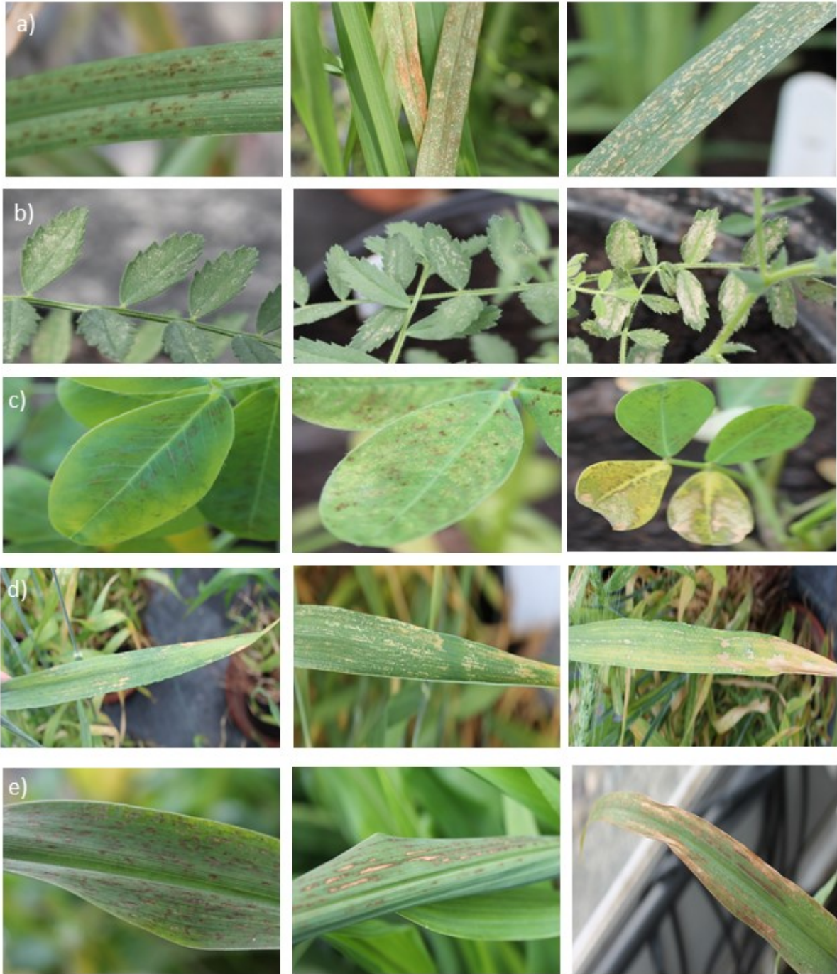
18 Figure S3: Progression of visible ozone symptoms in: a) Finger millet ( Eleusine coracana ); b) 19 Chickpea ( Cicer arietinum ); c) Peanut ( Arachis hypogaea ); d) Common wheat ( Triticum aestivum ); e) 20 Pearl millet ( Pennisetum glaucum ).