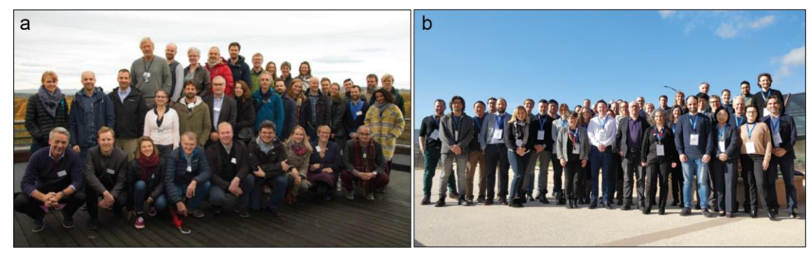
Figure 1. Group pictures of the participants to the LEWS workshops held in Oslo, Norway in 2016 (a) and in Perugia, Italy in 2020 (b)