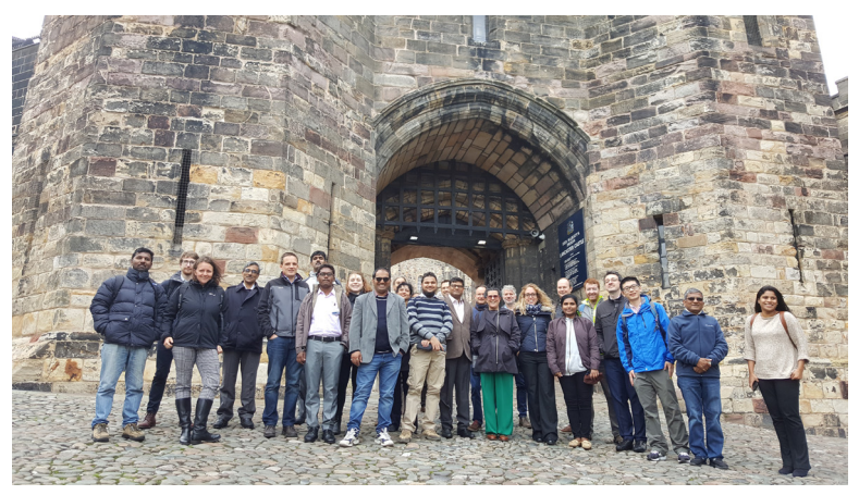
Figure 5: Part of the delegation at the entrance to Lancaster Castle