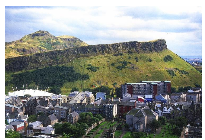
Figure 6. The dramatic skyline of Edinburgh created by Salisbury Crags, with Arthur's Seat looming in the background. BGS image P 517429.

Figure 5. McCormick's sketch illustrating the process and different ages of mountain building as recorded from Jameson's lecture 44 on 31 January 1831. The notebook page measures 195 mm x 135 mm. Image courtesy of the Wellcome Collection, London.