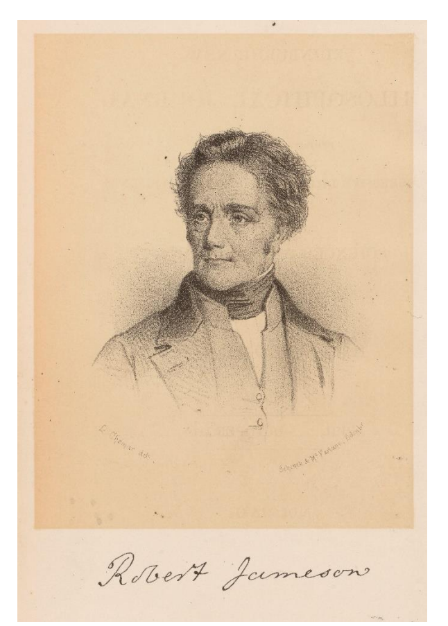
Figure 1. Robert Jameson (1774–1854) in later life. This portrait accompanied the obituary in The Edinburgh New Philosophical Journal that was compiled by Jameson's nephew Laurence Jameson (1854).