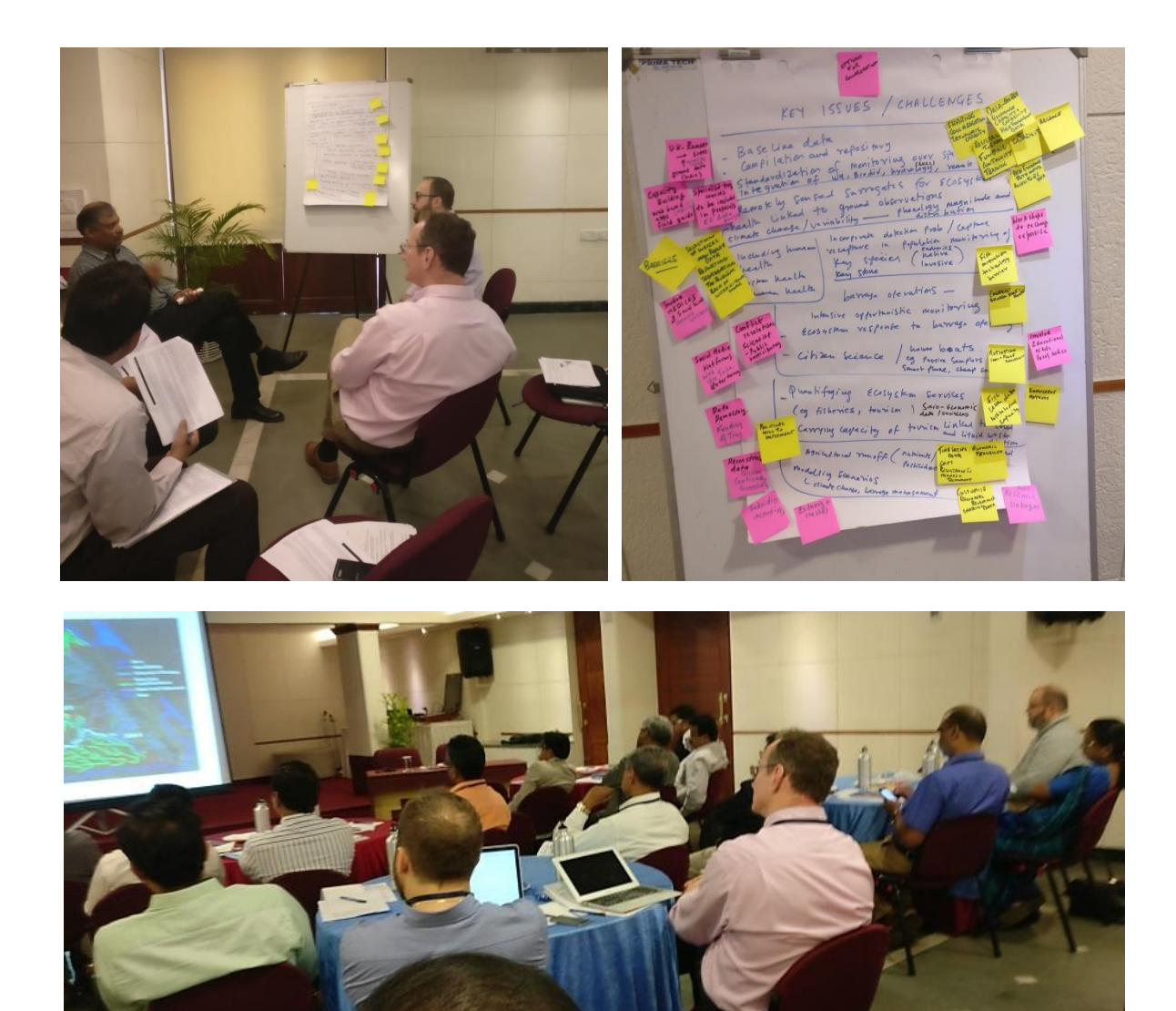
Figure 3: A look at UEI discussion sessions

The first exercise aimed to initiate discussions on two key aspects: the potential uses of previous UK-India joint research in the sector and the potential impact of using this science. The second exercise was designed to draw from discussions in exercise 1 and aimed at identifying specific factors/ barriers associated with uptake of different scientific methods. The third exercise aimed to identify the need for future collaborative work between scientific organisations and the state government bodies and the best way this could be achieved. To help streamline the discussions, the groups were asked to populate tables which were structured to specifically address the key questions for each exercise. A detailed plan for all three exercises, including the structured tables, is provided in Annex C.