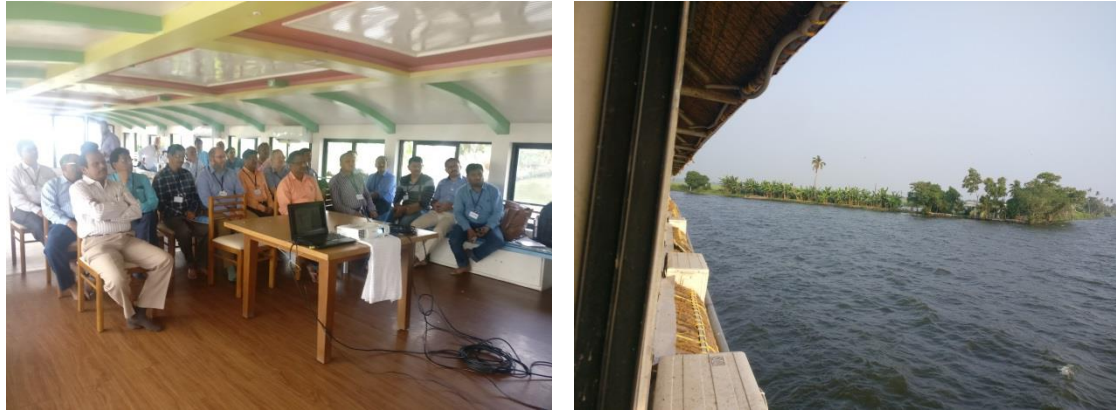
Figure 4: Field visit

The delegates were encouraged to consider how the technology discussed in the first four sessions of the UEI could be applied on ground to mitigate the impacts on the pristine ecosystem. To further this discussion there were demonstrations of the efficiency of in situ instruments like WISP–M, passive sesors for monitoring of optical and qualitative parameters from the lake and a demonstration of the applicability of SALTMED model as a tool for efficient use of water, crop, and fertilizers to the delegates (copies of the model software were also provided to the delegates).