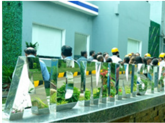
Figure 4: Delegates being addressed at offices of the pharmaceutical company