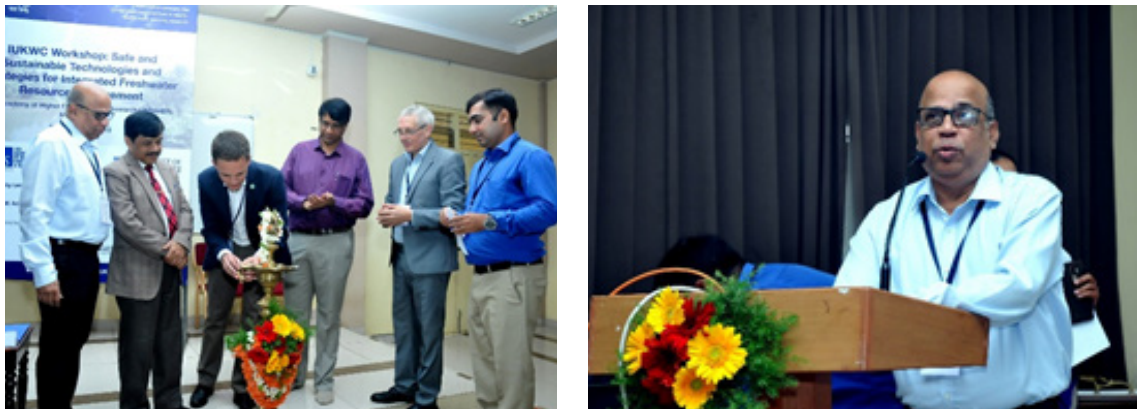
Figure 2: Lighting of the sacred lamp (left) and Keynote address by Prof PP Majumdar (right)

Overall, there were twenty four talks and twelve posters presented during the workshop. The abstracts for these talks and posters are available to members of the Open Network at IUKWC.org . Open Network members are also able to access the presentations from the workshop here.