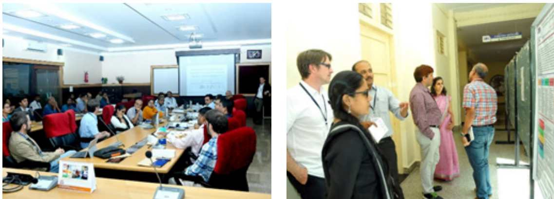
Figure 3: Discussions (left) and Poster presentations (right)