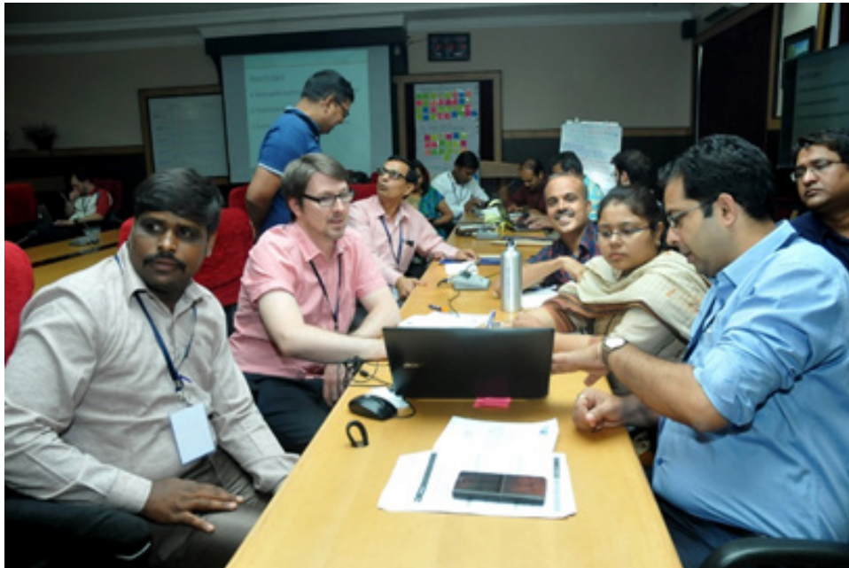
Figure 6: Delegates engaged in group discussions