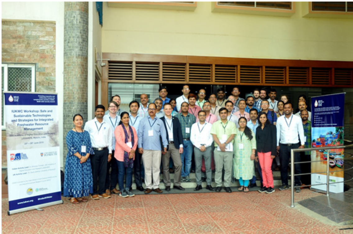
Figure 1: Delegates of the Scientific Workshop held in June 2019, JSSAHER, Mysuru.

The report is intended for the workshop participants, India-UK Water Centre members and stakeholders.